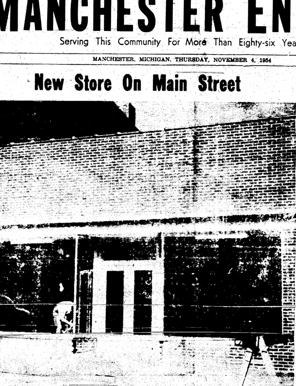
Lanmon's Variety Store will re-open Friday in this new addition to the Manchester business section...

New Store On Main Street MANCHESTER, MICHIGAN, THURSDAY, NOVEMBER 4, 1954