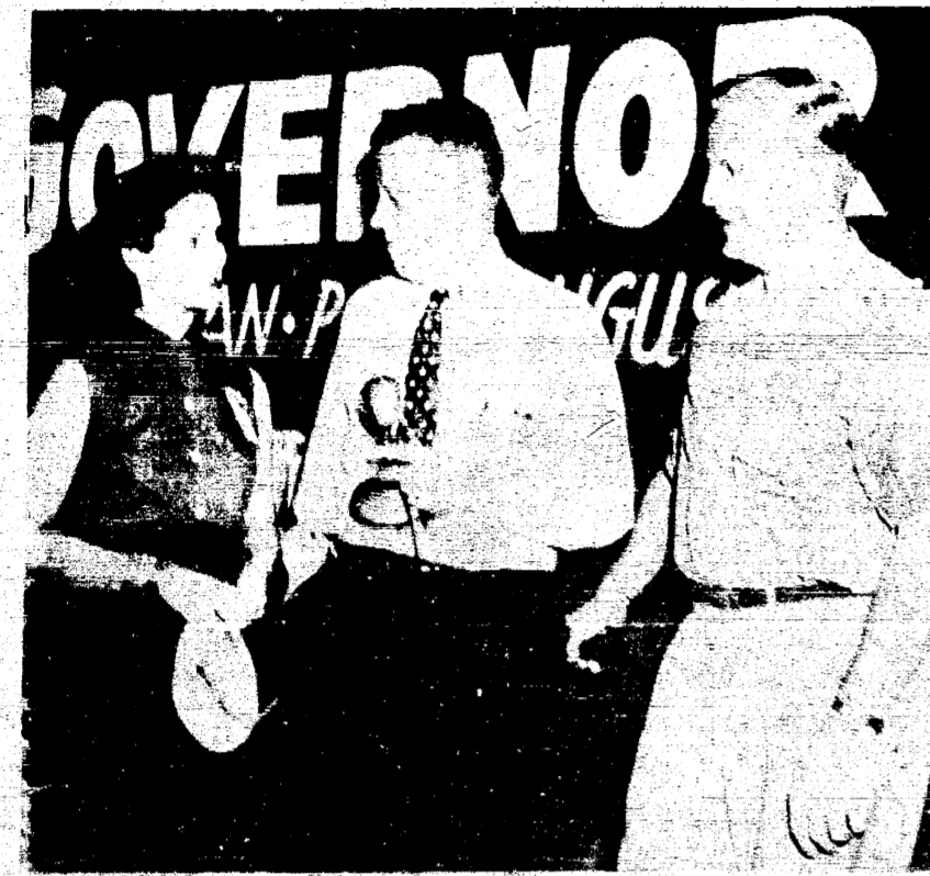
Over 30 "TNT" Party Republicans... The picture was taken at a family picnic held at the Milliken farm on the Dexter-Franklin Road Sunday from 4 to 6 p.m. Approximately 30 people were present at the picnic.