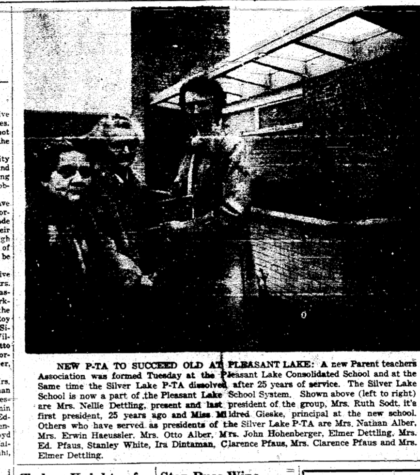
NEW P.T.A. TO SUCCEED OLD AT PLEASANT LAKE: A new Parent teachers Association was formed Tuesday...