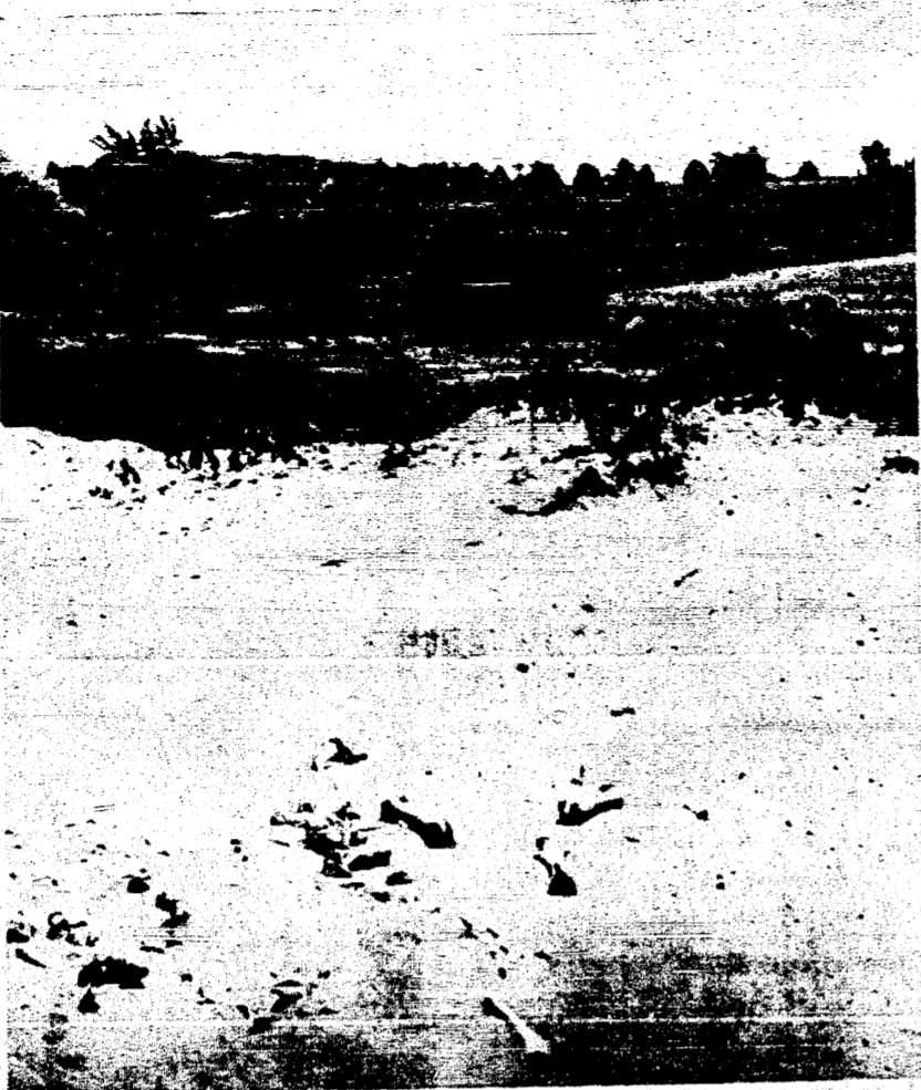
Nearing the last stage before being abandoned in this farm... not in the deep south or far west, but here in Michigan in northern Kalamazoo county. Shifting sands uncover the remains of a horse, presumably buried deep enough, some 10 years ago. Layers of topsoil this layer of topsoil well with heavy machinery, which, with a smaller speed cover were grown 10-15 years ago. To save the remaining land from a like fate, conservation district forester Fred Eskin is recommending the planting of a mixed stand of oak and red pine which some day would stabilize the soil and produce an annual, valuable pulpwood and timber crop.