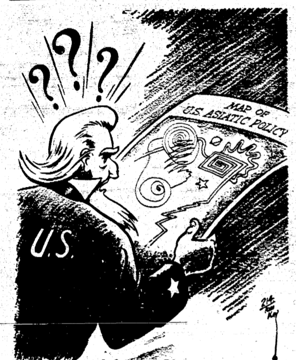
A Chinese Puzzle