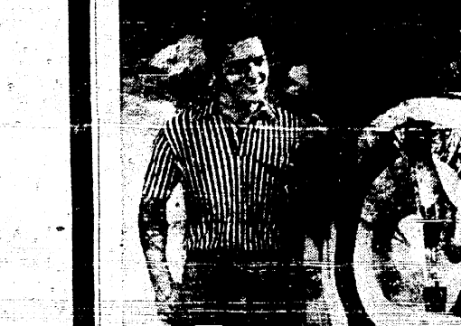
Visits 4-H's in Europe

The long bow which once turned the tide of battle and decided the fate of nations is now used for sport in archery. The fun to score a bull's-eye as well as to be properly attired in the occasion is the main attraction in the summer sport fashions in the Arrow knit shirt. In attractive rayon candy stripes in a plaid model with a cotton rib knit shirt, which has proved popular