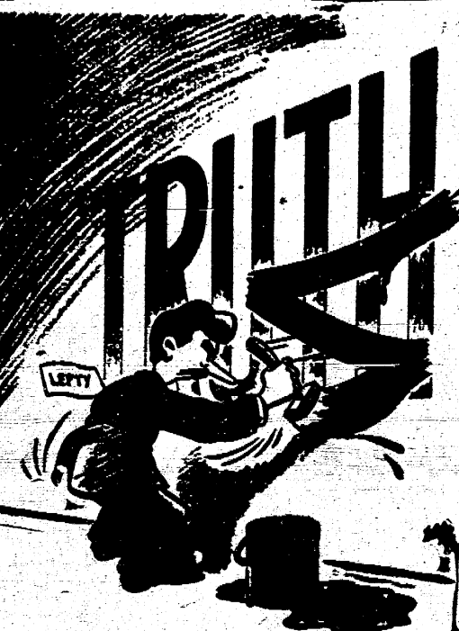
The Smear Artist

public funds was particularly interesting. Individuals and firms from across the country were asked to express their support for sharp reduction of expenditures on such material. On the other hand, a New York City resident wrote to ask for copies of "The Times for Cooking Muskrat Meat." He explained: "I want this information for a man who traps muskrat on my property, but who does not prepare the meat to my taste," and signed "Thanking you in anticipation."