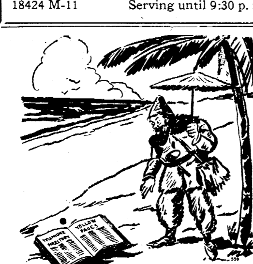
"Oh, Boy!—the telephone directory—I'll look up a travel bureau in the Yellow Pages."

SHORE'S Restaurant 18424 M-11 Serving until 9:30 p. m.