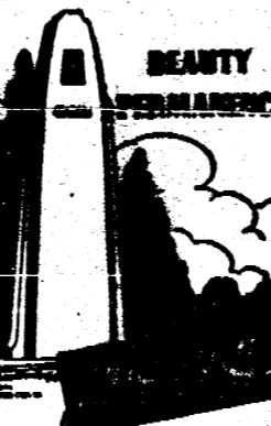
BEAUTY ... Two marvelous methods are faithfully served ...