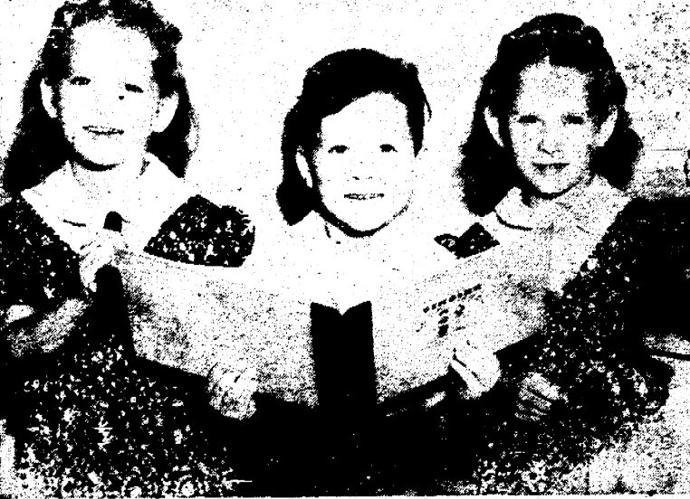
Adorn with good health, this trio from Lansing—twins and a singing companion—are unusual models. They will be seen by thousands of Michigan children in the December issue of the Wolverine Health Bulletin. The bulletin is a monthly health teaching paper financed by tuberculous Christmas Seal funds. The bulletin is a monthly health teaching paper financed by tuberculous Christmas Seal funds. The bulletin is a monthly health teaching paper financed by tuberculous Christmas Seal funds.