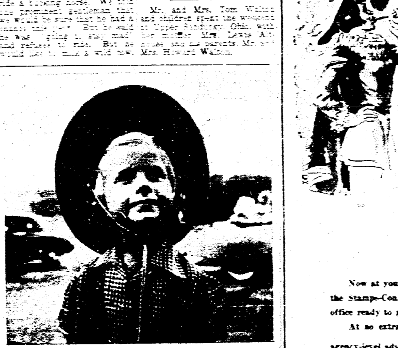
"Look Before You Shoo!"

Yes, it's a wonderful, carefree feeling, and you can have it too. Here's what you do: Invest in U. S. Savings Bonds for your financial independence.