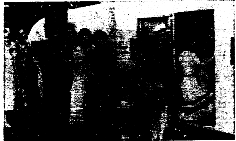
Cooperating with the Detroit Board of Health, the Tuberculosis & Health Society of Wayne County will feature their mobile unit at the Michigan State Fair from September 1 through September 15.