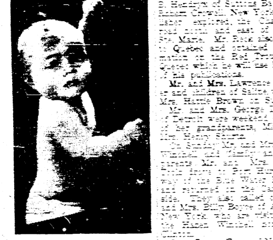
LOOK, I'm standing on my own two feet!

About 1,200 persons were involved in the U.S. Shoppers' Day.