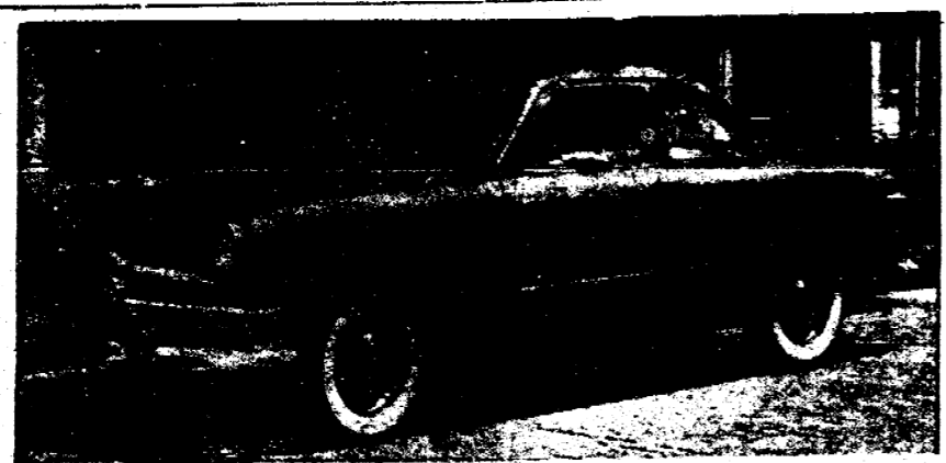
Eleven choices of colors combined with new interior styling are featured in the 1936 Ford Custom Deluxe Club Coupe and other models just introduced by Ford dealers throughout the nation. Ford Division has accomplished greater comfort, safety and economy as well as improved beauty of styling in its 1936 models.