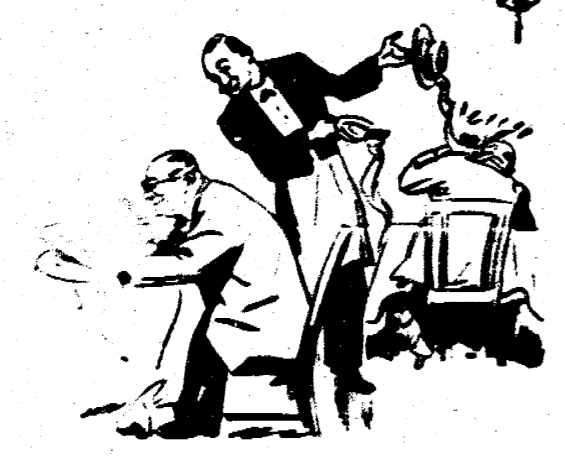
See telephone directory Yellow Pages for complete listing over with useful information.