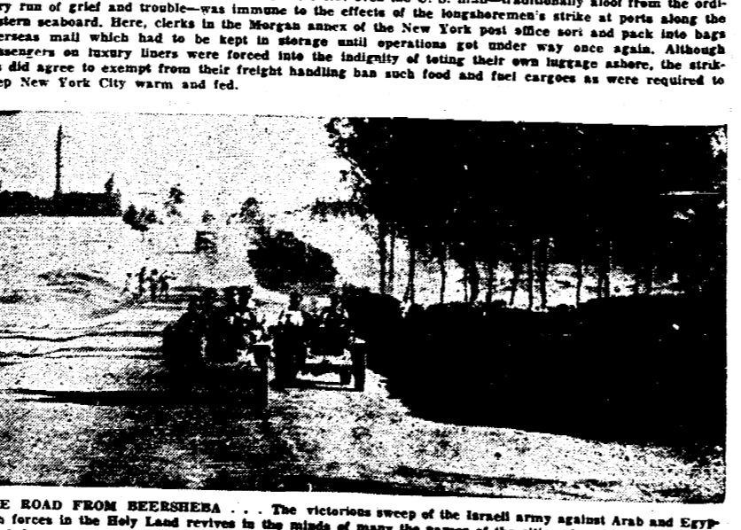
THE ROAD FROM BEERSHEBA... The victorious sweep of the Israeli army against Arab and Egyptian forces in the Holy Land revives in the minds of many the names of the Old Testament—modern vehicles of war are spreading over the main Gaza-Beersheba road after the capture of the aged city. The Mosque of Beersheba can be seen towering in the background. The city was wrested from the Egyptians by Israeli forces after the U. N. enforced truce in the Holy Land broke down.