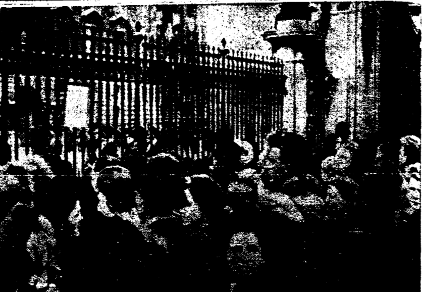
THE MORNING AFTER... A seething London crowd gathered in front of Buckingham Palace's gates the morning after the royal baby arrived. In the center, the Duchess of York, Princess Elizabeth, and her newborn son who some say may be ruler of the British empire. It was a happy, good-natured crowd, where dozens contemplated the attitude of the British people toward authority. When this picture was made, the newborn, not yet named, prince was nearly 12 hours old. He ruled a 41-year reign on his arrival.

THE RED-HEADED radio comic explains why he is laughing at his jokes, or why he is not laughing at his jokes.