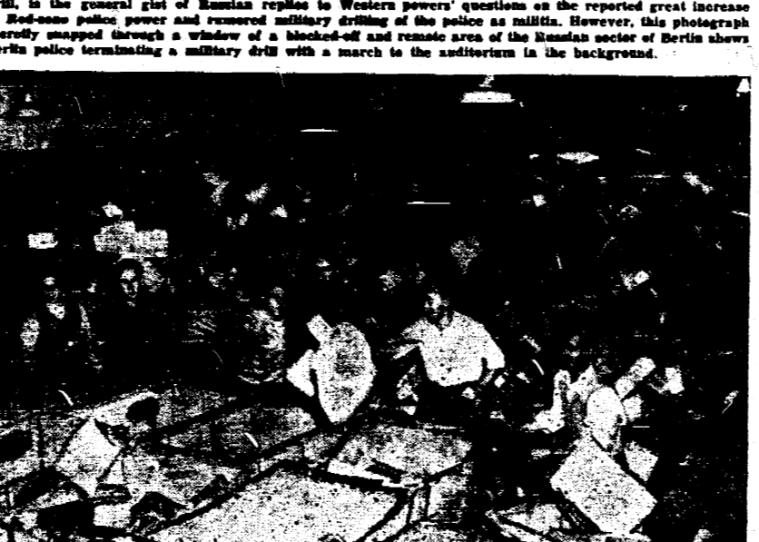
HARBOR HOLIDAY AND MAIL MELEE... Not even the U. S. mail—traditionally aloof from the ordinary run of grid and trouble—was immune to the effects of the longshoremen's strike at ports along the eastern seaboard. Here, clerks in the Morgan sector of the New York post office sort and pack into bags the overseas mail which had to be kept in storage until operations got under way once again. Although clerks did agree to exempt from their freight handling bus food and fuel cargoes as were required to keep New York City warm and fed.