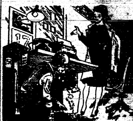
The managing editor's head was bowed under his desk in search of the last cigarette when a pair of slippers lay open.