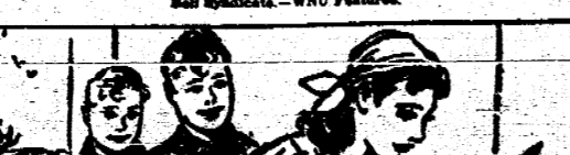
The boys and I have shared three upper rooms now, and bridled them in.

HERE is a letter which came to me recently. It asks no question, but putting it before me because it makes me think seriously and begin to answer a great many questions in my own mind.