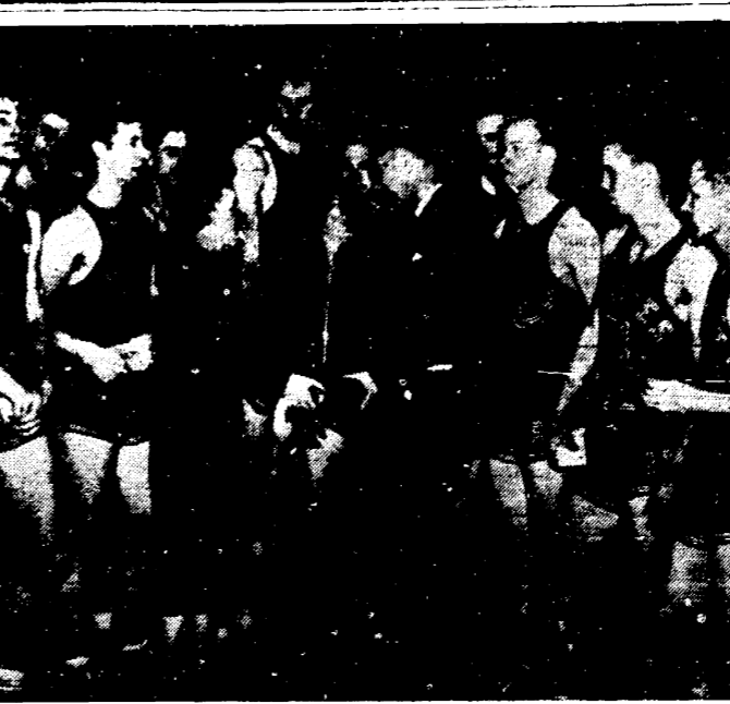
OKLAHOMA WINS NATIONAL BASKETBALL TITLE AGAIN... For the second year in a row, Oklahoma A. & M. college, Stillwater, won the NCAA basketball championship...