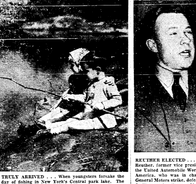
REUTHER ELECTED... Walter Reuther, former vice president of the United Automobile Workers of America...