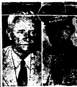
Adm. Chester W. Nimitz, left, and Gen. Douglas MacArthur, were appointed joint commanders in our war against Japan. The final result was never in doubt after they swung into action.