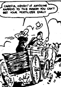
GRACIE, ready if anyone happens to this man you can't get her reaction down!