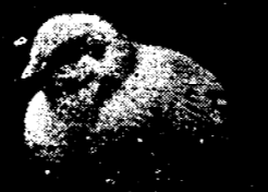
Chickens started with Farm Waste.

Vitamins are absolutely necessary for poultry-to baby chicks they are all-essential. Considerable work has been done in order to provide poultry with the elements, either from vegetable or animal source and rapid improvement has taken place by the department of agriculture. The newest source is procured from waste vegetable leaf meal.