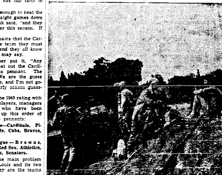
Ernie Pyle, famous war correspondent, acclaimed as the fighting man's personal reporter, recently killed by a Jap machine-gun bullet on a little island off Okinawa, is shown in his last photo. This is typical of the way he covered both wars, by living and working with the men. He escaped death several times while covering the war with Germany.