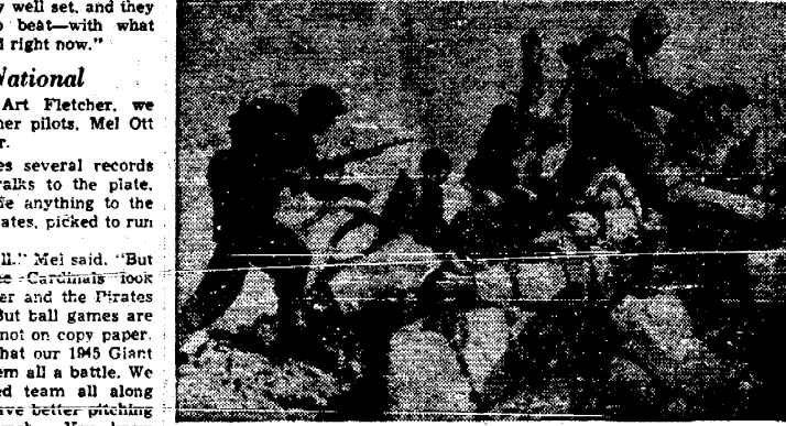
Equipped for any emergency, marines who landed at Okinawa huddled as they pushed across the island. First phase of the operation brought little opposition, the invading forces were quick to grasp the opportunity, and the early assault waves drove to the interior of the island shortly after they hit the beach. Strong opposition came later.