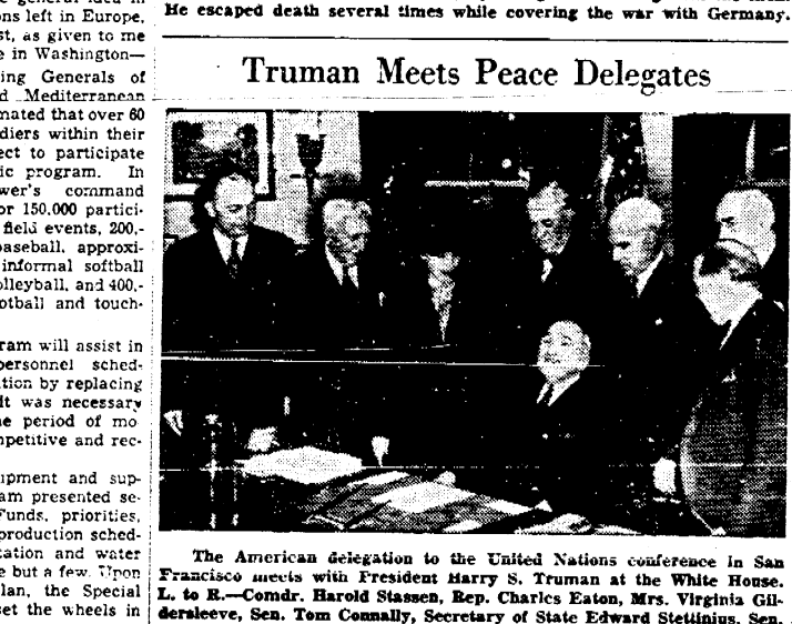
The American delegation to the United Nations conference in San Francisco meets with President Harry S. Truman at the White House. L. to R.—Comdr. Harold Stassen, Rep. Charles Eaton, Mrs. Virginia Gilchrist-Deane, Sen. Tom Connally, Secretary of State Edward Stettin, Sen. Arthur Vandenberg, and Rep. Sol Bloom. President Truman, seated.