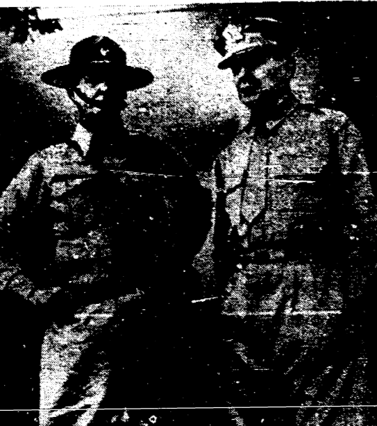
Gen. Jonathan Wainwright, then a major general, is pictured with General MacArthur, as they appeared in the Philippines shortly before the Jap invasion. Wainwright, who led the forces here on Corregidor, was captured by Japanese and is expected to rejoin General MacArthur, in directly issue all orders to the Japanese officials.

Never before had a ruler of Japan left his shores. In the past scarcely was an emperor seen by his subjects. Some idea of his isolation can be gained from the fact that the word "mika" means "awful"; the word "do" means "place"; and the name "Mikado" means "awful place."