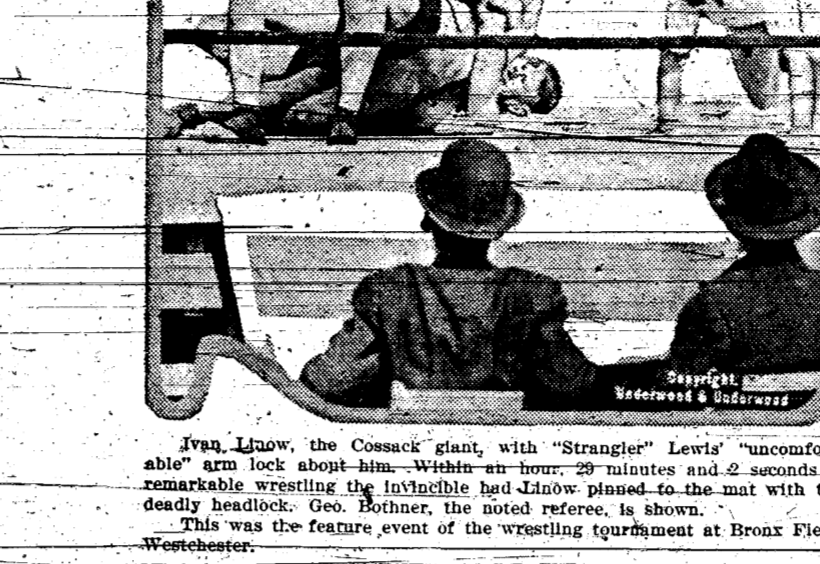
Ivan Linow, the Cossack giant, with 'Strangler' Lewis' unconformable arm lock about him...