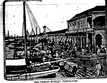
NEW MARINA STREET, MARACAO

COMPARATIVELY few travelers who have made the long tour of the South American continent care to continue the voyage to the several countries bordering on the Caribbean without a period of rest. They usually return to the United States directly from Colon and possibly visit the German national park on one of the many yachts now so extensively advertised by steamship and tourist companies.