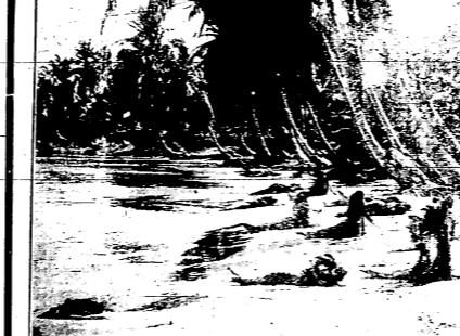
ENCHANTING MERMAID GROTTO IN WILLIAM FOX'S PICTURE BEAUTIFUL, "A DAUGHTER OF THE GODS"

MATINEE THURSDAY, 2:15 P. M. WILLIAM FOX Presents