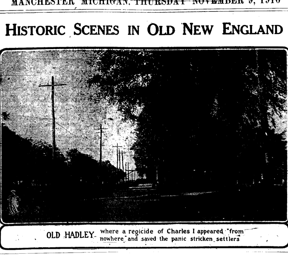
OLD HADLEY, where a relic of Charles I appeared from nowhere, saved the panic stricken settlers.

Old Hadley, a beautiful New England town, situated upon the east bank of the Connecticut River some twenty miles north of Springfield, Mass., was a center of great activity during the stirring days of King Philip's Indian war.