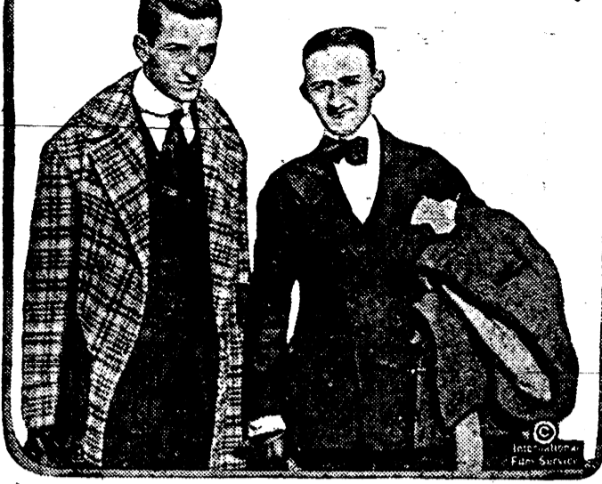
Twelve volunteer ambulance drivers and two orderlies called from New York on the French liner Lafayette for service with the American ambulance in France.