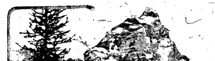
View from the-Brewer Forest.

Millions of folks bathe internally and externally with a glass of real First—Thought He Was Being a Fool, but He Wasn't.