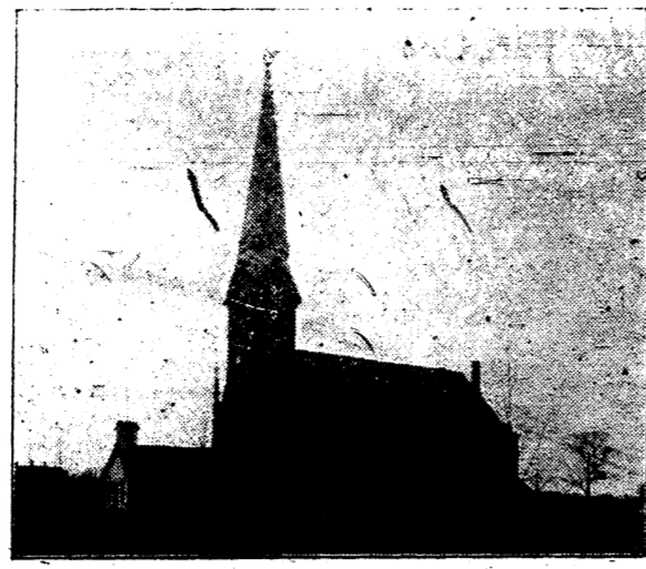
EMANUEL'S GERMAN CHURCH, MANCHESTER

Hillsdale County's Annual Holiday Week—join the crowd, take an outing POPULAR PRICE 25 CENTS