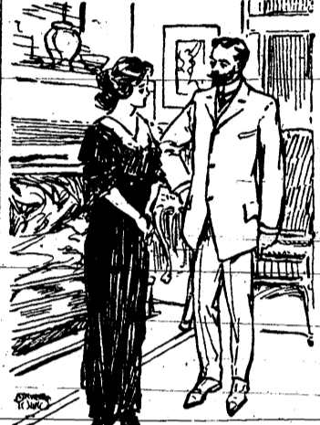
Her Eyes Were Moody, Her Voice Rather Lifeless.

HIT THE SPOT. Postum Knocked Out Coffee Ails. There's a good deal of satisfaction and comfort in hitting upon the right thing to rid one of the varied and constant ailments caused by coffee drinking.