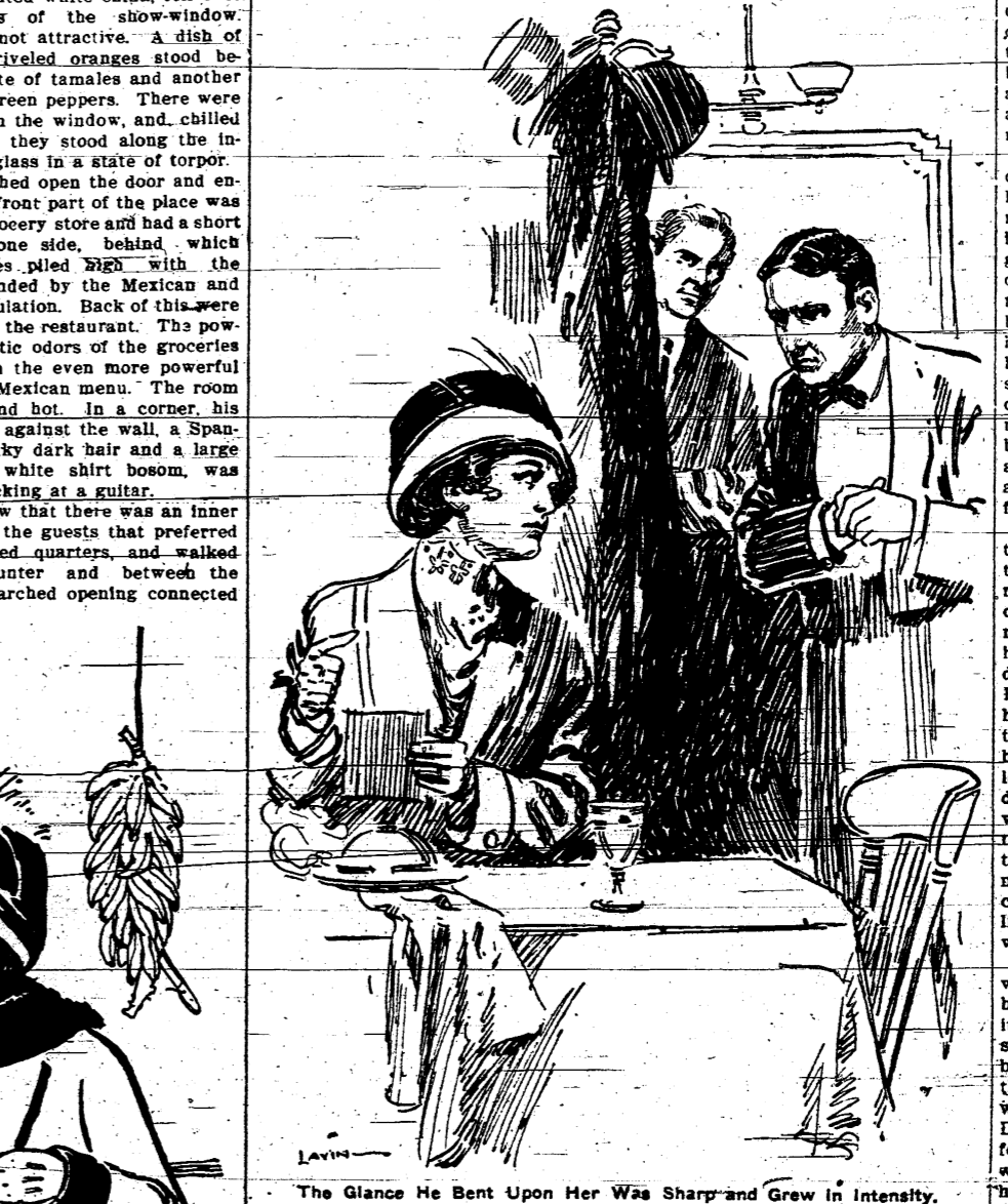
The Glance He Bent Upon Her Was Sharp and Grew Intensely.

CHAPTER XX. The Actor's Story. The afternoon of the next day, Donnell came home earlier than usual.