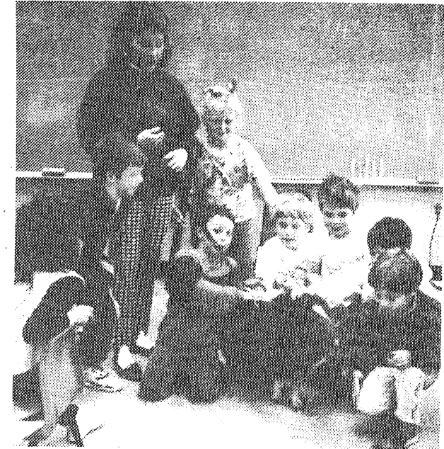
CASEVILLE'S FIRST GRADERS enjoyed a visit from Amos, a pot-bellied pig on May 1.