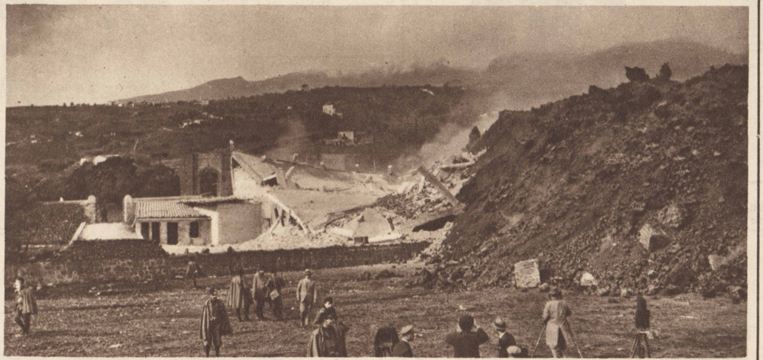
MOUNT ETNA awoke and poured forth a fiery flood of lava, snuffing out 10,000 homes and burying three towns. Huge stretches of Sicilian countryside were swept by the writhing flow.