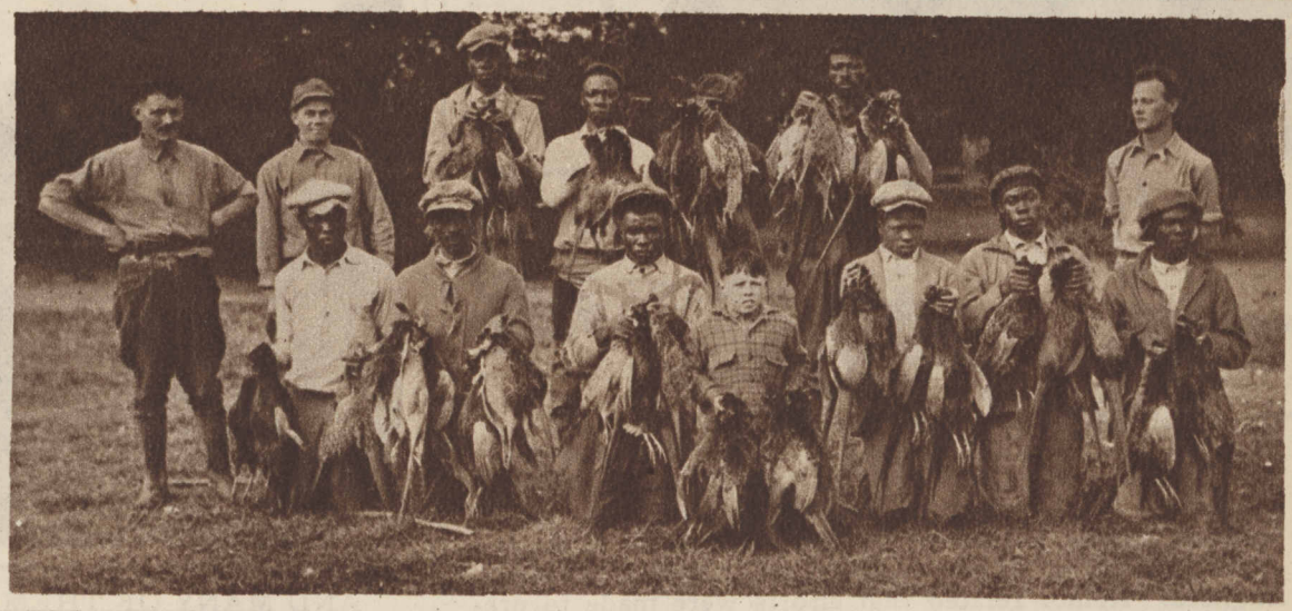
IT WAS THE GREATEST PHEASANT HUNT ON RECORD , if we believe the New York sharpshooters who participated in the Georgia shoot. Here is Exhibit A in evidence.