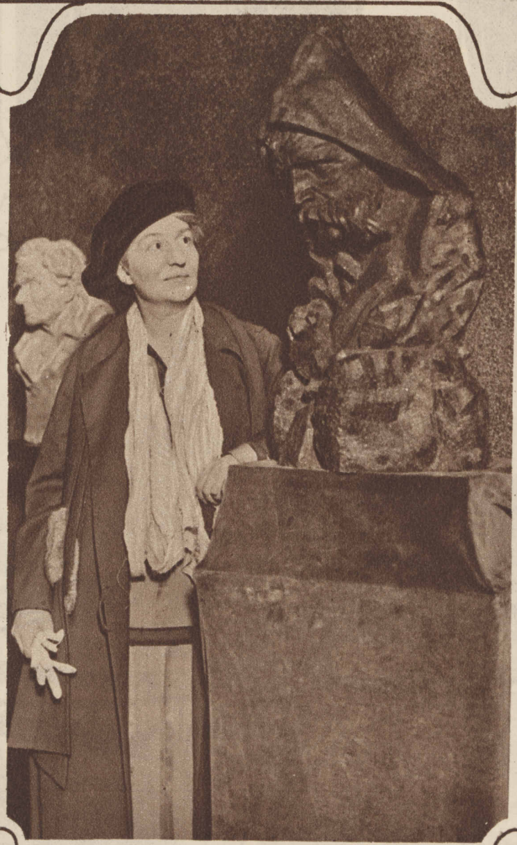
THE COAL MAN in his own element. A Parisian coal heaver sculpted from a single block of chemically treated anthracite was one of the features in a New York exhibition of the work of Malvina Hoffman, American sculptress. It is the artist herself beside the dusky gentleman.