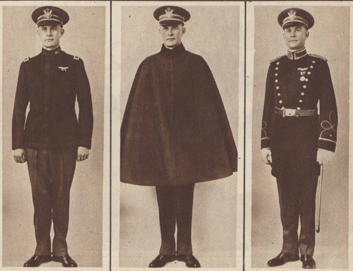
WHAT THE WELL-DRESSED ARMY OFFICER WILL WEAR in the near future, as the result of new regulations issued by the war department. Left to right, blue dress uniform, blue cape, and blue full dress.