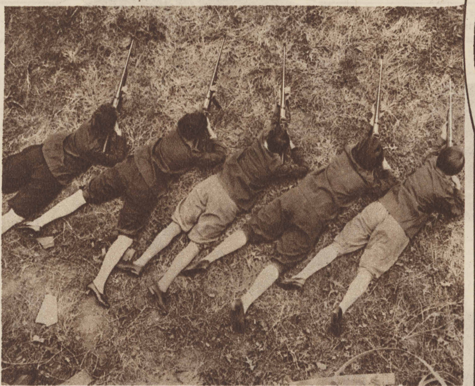
YOU CAN LOOK DOWN ON THEM in this picture, but they challenge competition on the rifle range. The five are co-eds of the girls' rifle team of the University of Maryland, which has gone through the scholastic year thus far without defeat.