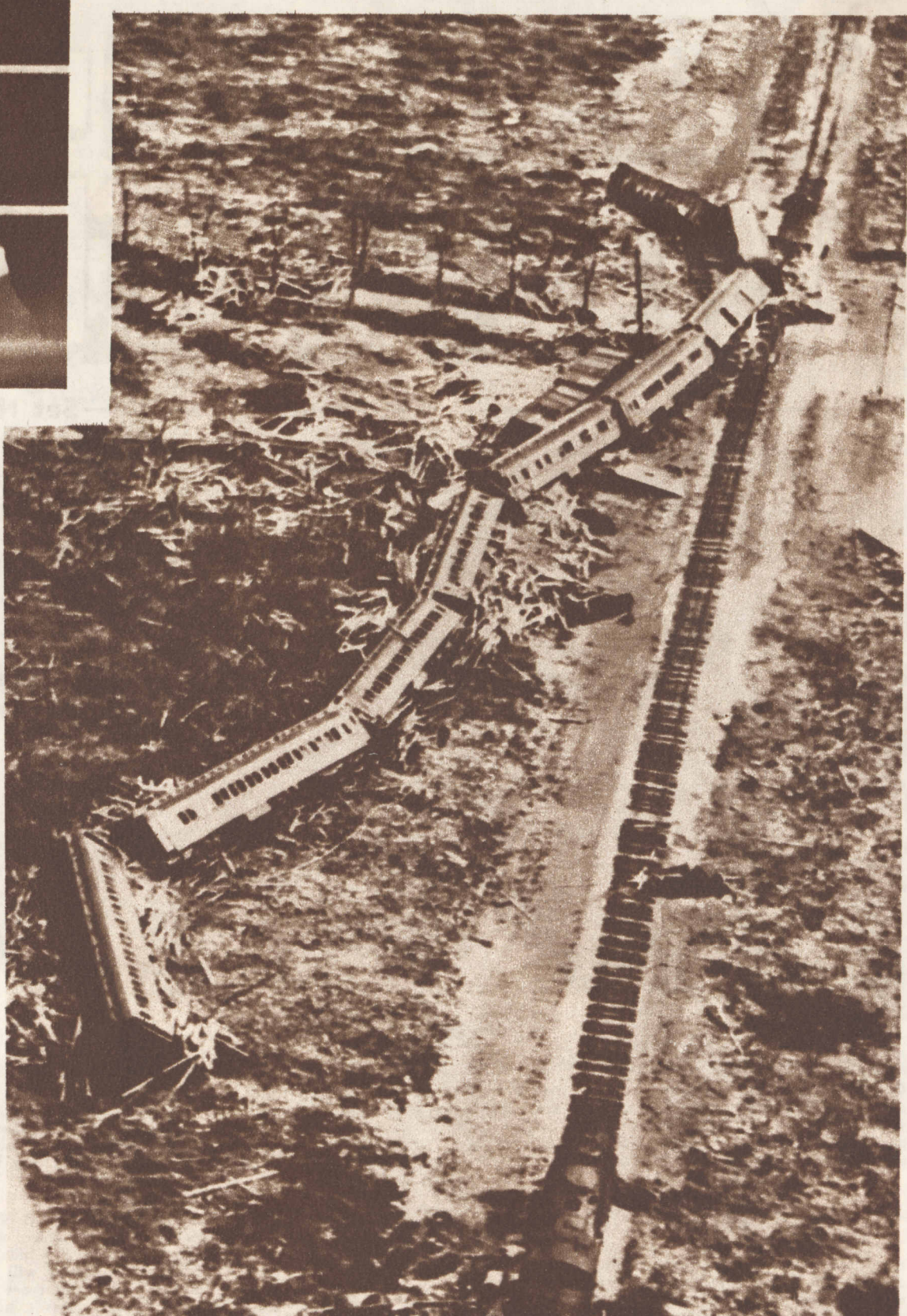
HURRICANE in September snuffs out the lives of 282 war veterans on Florida keys as they await the rescue train that never came.