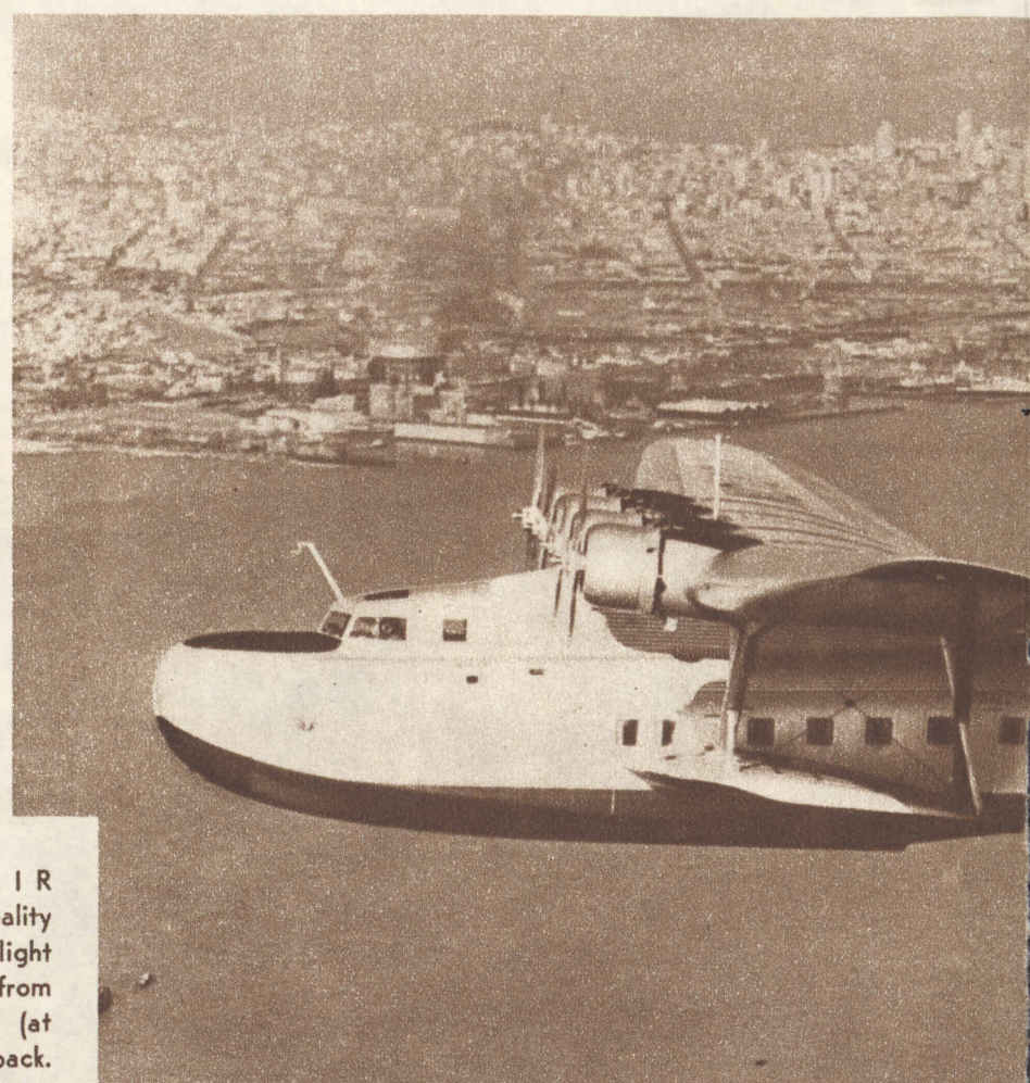
TRANSPACIFIC AIR MAIL becomes a reality with the November flight of the China Clipper from the Golden Gate (at right) to Manila and back.