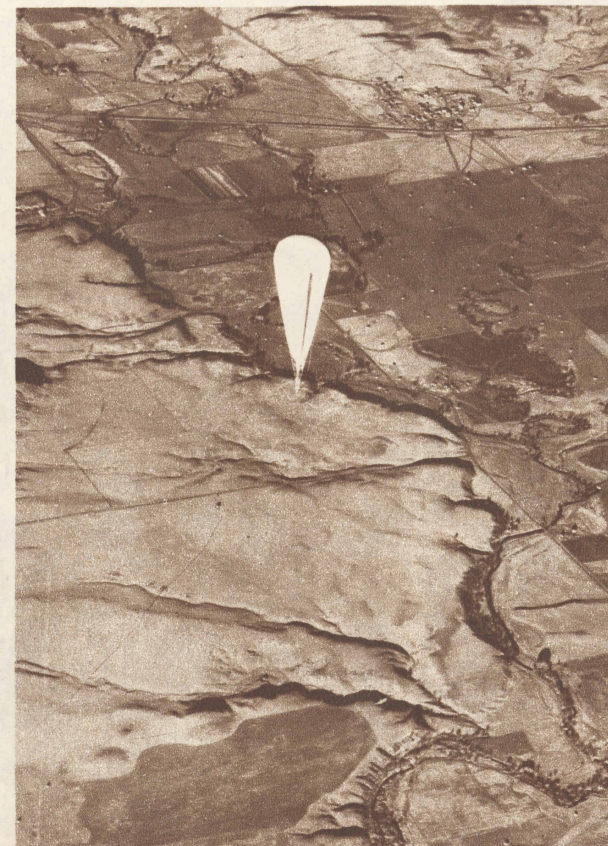
THE STRATOSPHERE is pierced for a record altitude of 72,395 feet in the November flight of the Explorer II, at Rapid City.