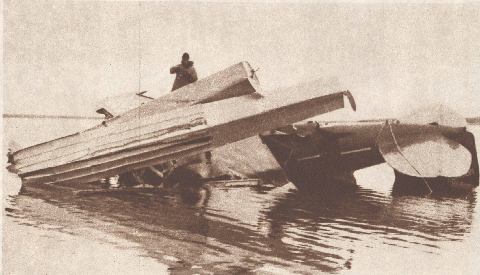
WILL ROGERS AND WILEY POST crash to death in the wreckage of this plane in an Alaskan tragedy of August.