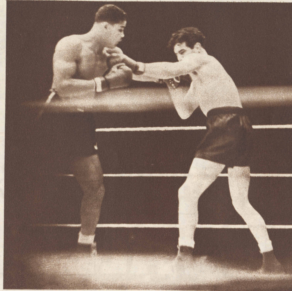
JOE LOUIS, Golden Gloves champion, whips Max Baer in September and Paulino Uzcudun in December along the heavyweight title trail. Above: A left to Baer's jaw.