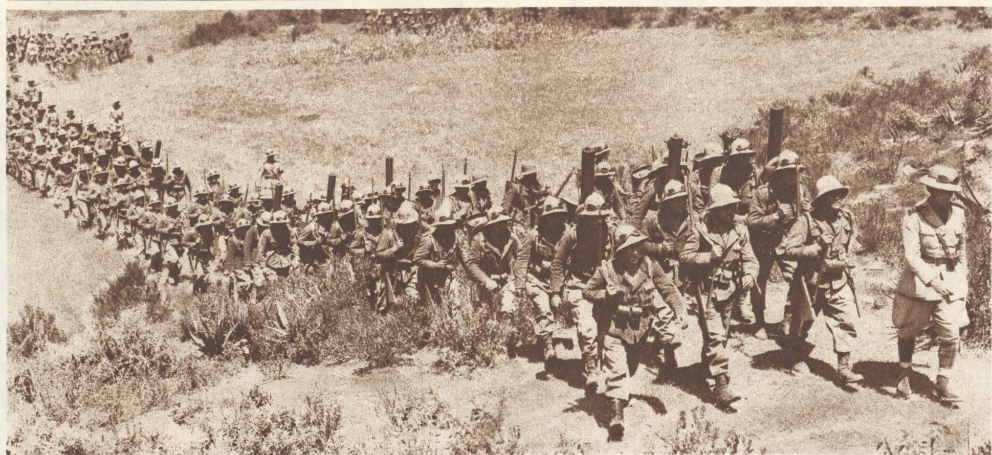
WAR bursts upon Africa as Mussolini's armies stage an autumnal march into Ethiopia.