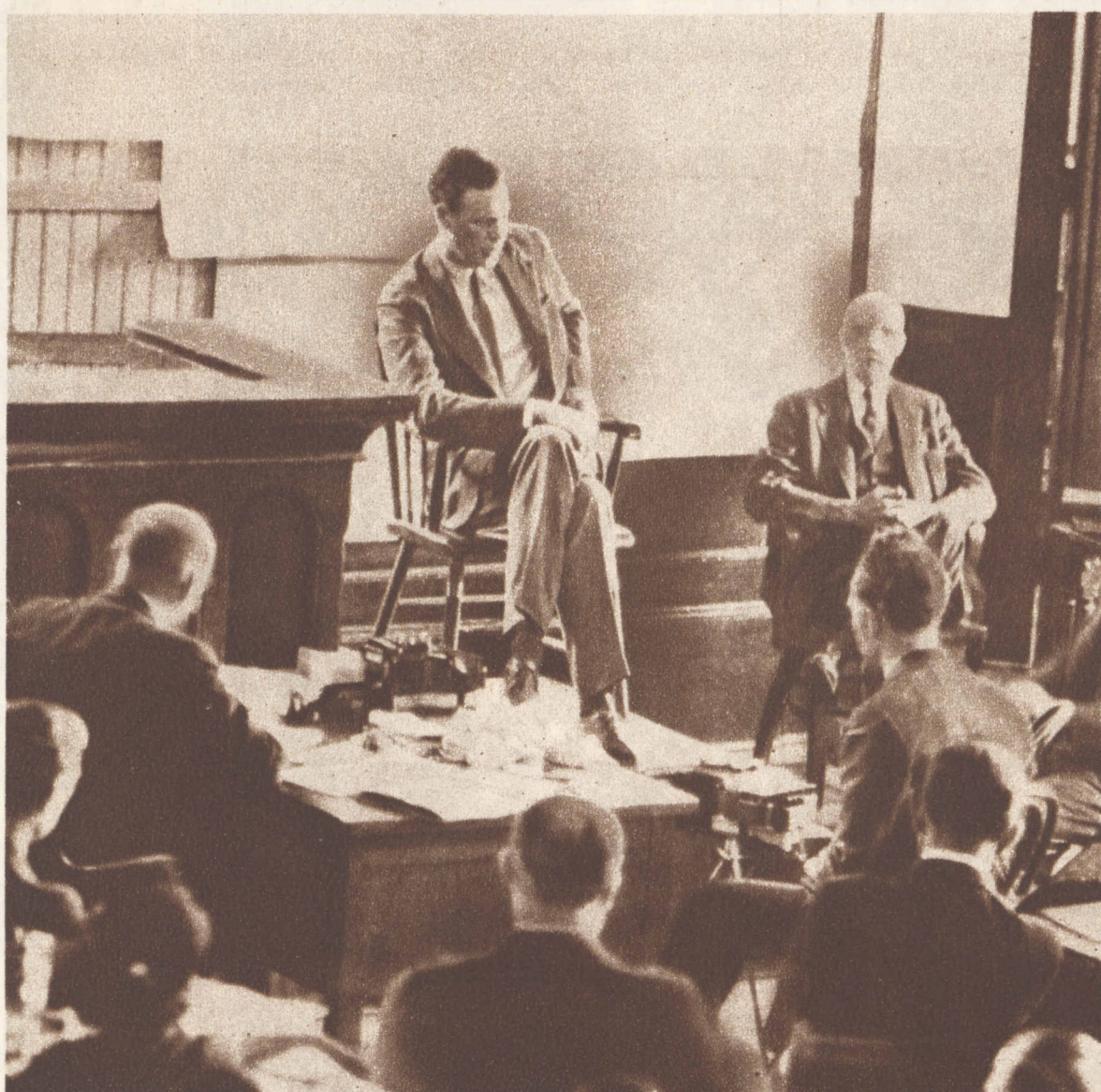
BRUNO RICHARD HAUPTMANN is doomed to death for the kidnaping of Charles A. Lindbergh Jr. Above: Col. Lindbergh on the stand in January at Flemington, N. J.