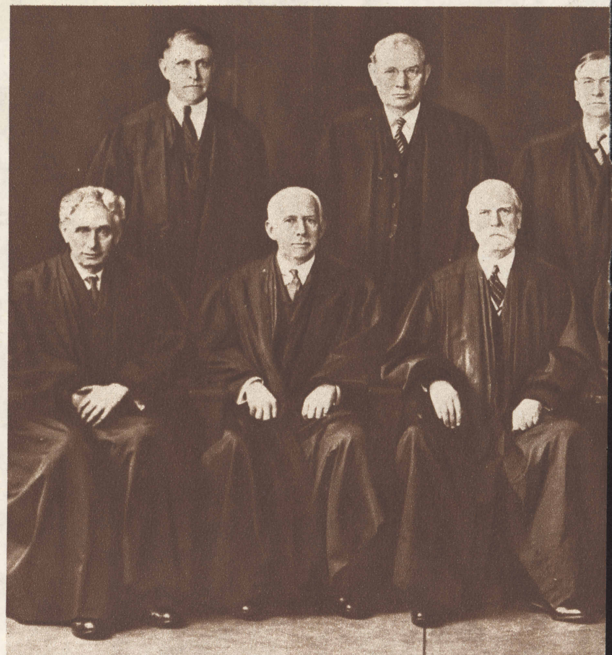
NRA goes to the unconstitutional junk pile in May, a United States Supreme court decision jolting the New Deal with its greatest defeat to date. Seated: Justices Brandeis and Van Devanter; Chief Justice Hughes; Justices McReynolds and Sutherland. Standing: Justices Roberts, Butler, Stone, Cardozo.