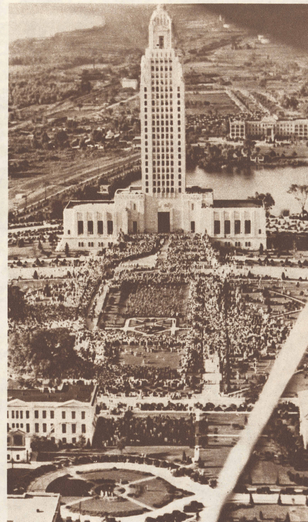
HUEY LONG is assassinated by Dr. Carl A. Weiss Jr., who in turn is slain by the senator's bodyguard; and throngs witness the September funeral (above) on the Louisiana state house lawn.