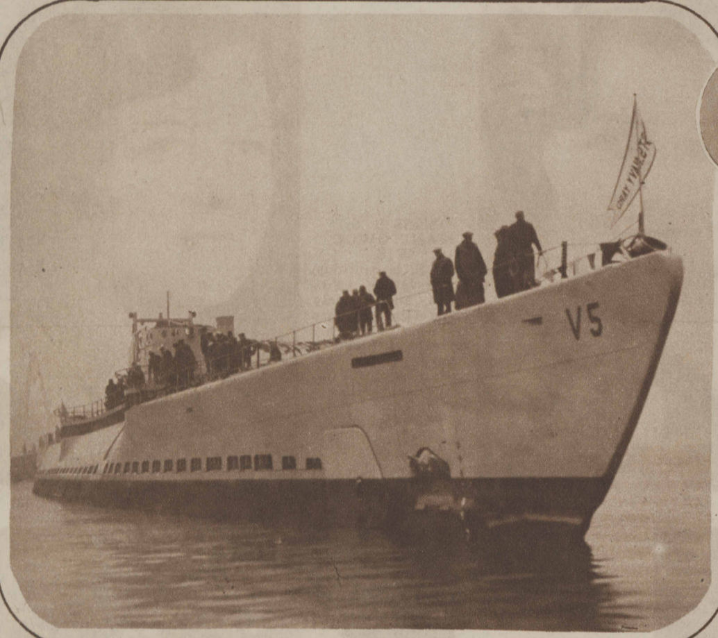
UNCLE SAM'S NEWEST SUBMERSIBLE is the giant V-5, 371 feet long and launched at Portsmouth, N. H. The first of its type, it is designed for long distance service.