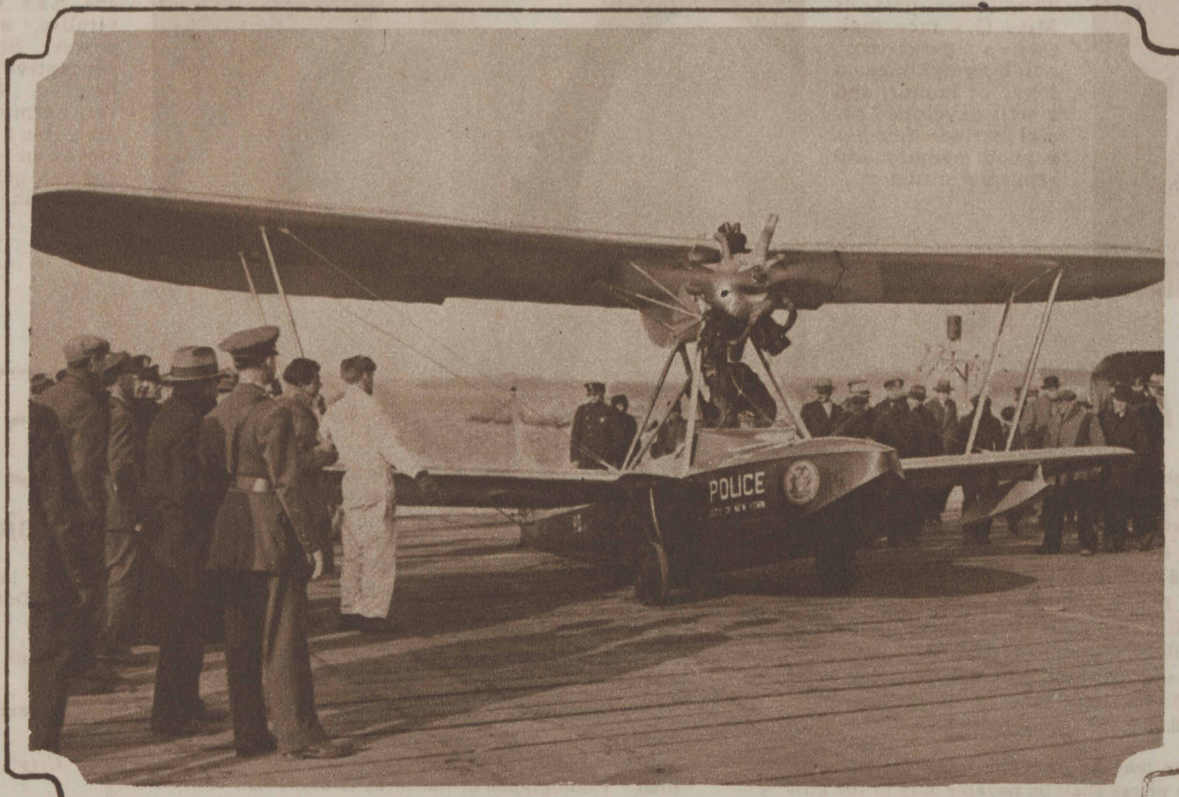
POLICE TAKE THE AIR in New York, with the christening of two planes for lightning action. One of the machines of the department's new unit is shown going up the ramp following the ceremony.