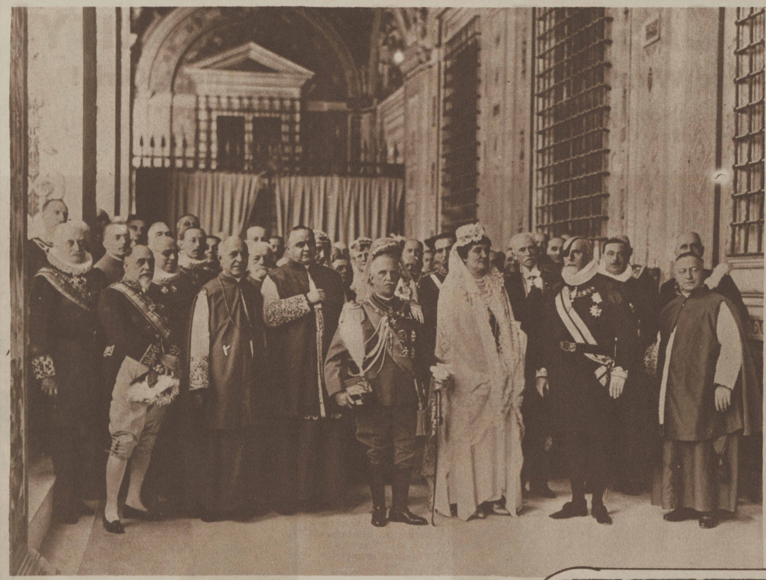
ROYALTY IN THE VATICAN —Signifying approval of the Lateran treaty, King Victor Emmanuel III. and his court rode in state to visit Pope Pius XI. The picture was taken in the vatican, with the king and queen of Italy surrounded by members of the holy see.