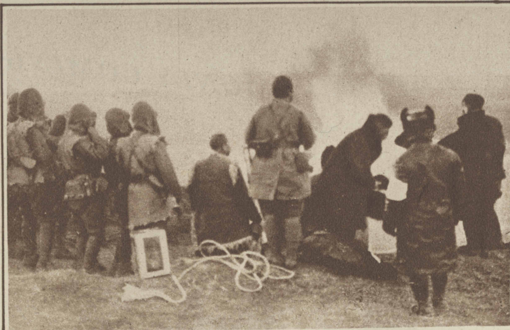
A JAPANESE MILITARY FUNERAL PYRE—While their comrades stand in silent prayer, the fallen soldiers of Nippon who lost their lives in the action at Tsitsihar are consigned to the flames in one large crematory pyre. Their ashes will be returned to Japan.