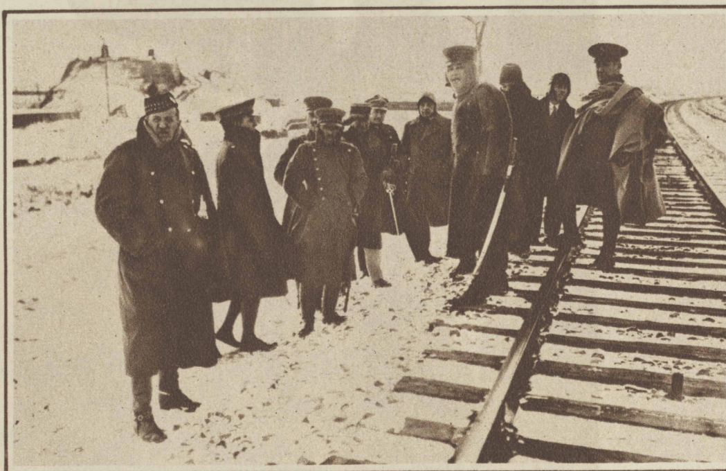
MILITARY ATTACHES OF THE DIPLOMATIC CORPS at Tokio were recently conducted by Japanese army officers on a tour of the Manchurian battle front. The bitterly cold weather is reflected in the facial expressions of this group.