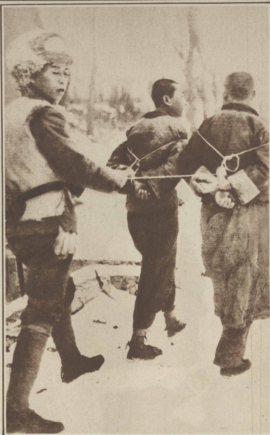
CHARACTERIZED BY THEIR CAPTORS AS BANDITS, these two bound Chinese captives are seen in the custody of a Japanese soldier.