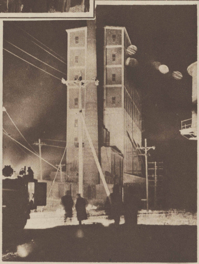
TRICK LIGHTING —Searchlights on a Chicago fire department truck threw a south side grain elevator into sharp relief while the firemen battled a recent blaze. Night was turned into day in the vicinity of the structure. These lights are an important asset to the fire fighters.