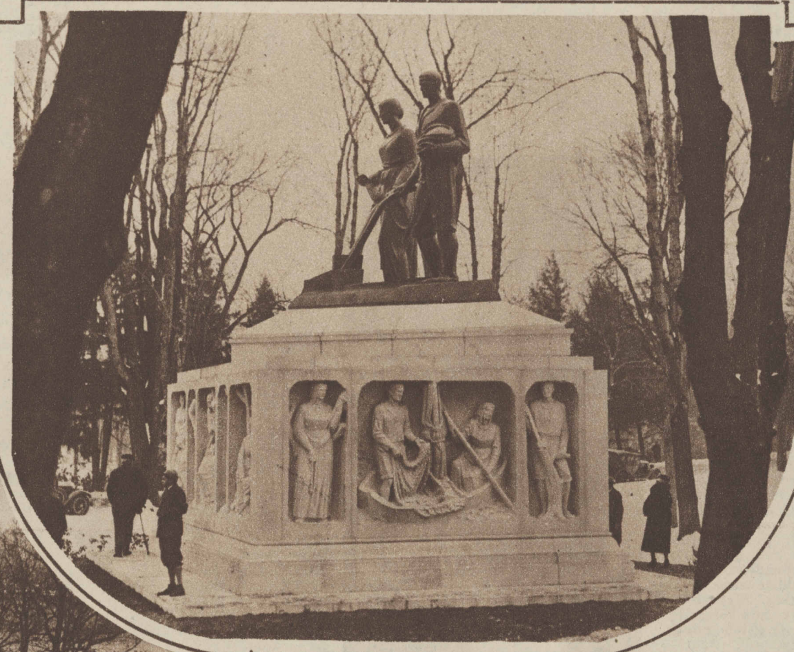
REMEMBERING OUR COLONIAL FATHERS —This unusual monument, dedicated to "the early settlers of New England," has just been unveiled at Worcester, Mass.