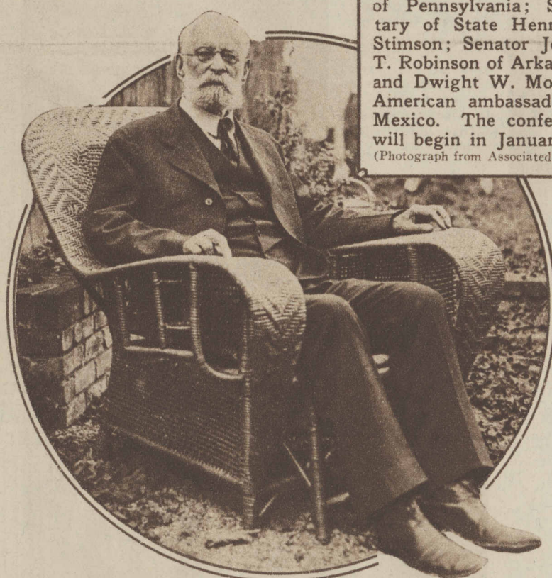
NESTOR of northern conquerors. Maj. Gen. A. W. Greely, who in 1882 wrested from the British the "farthest north" record they had held for three centuries, presents this hale and hearty appearance at the age of 86. He is found here at his Washington suburban home in Georgetown.