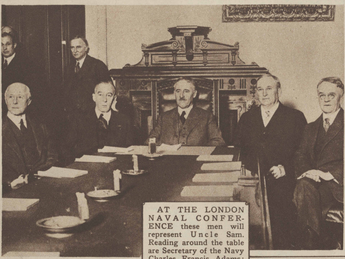
AT THE LONDON NAVAL CONFERENCE these men will represent Uncle Sam. Reading around the table are Secretary of the Navy Charles Francis Adams; Senator David A. Reed of Pennsylvania; Secretary of State Henry L. Stimson; Senator Joseph T. Robinson of Arkansas; and Dwight W. Morrow, American ambassador to Mexico. The conference will begin in January.