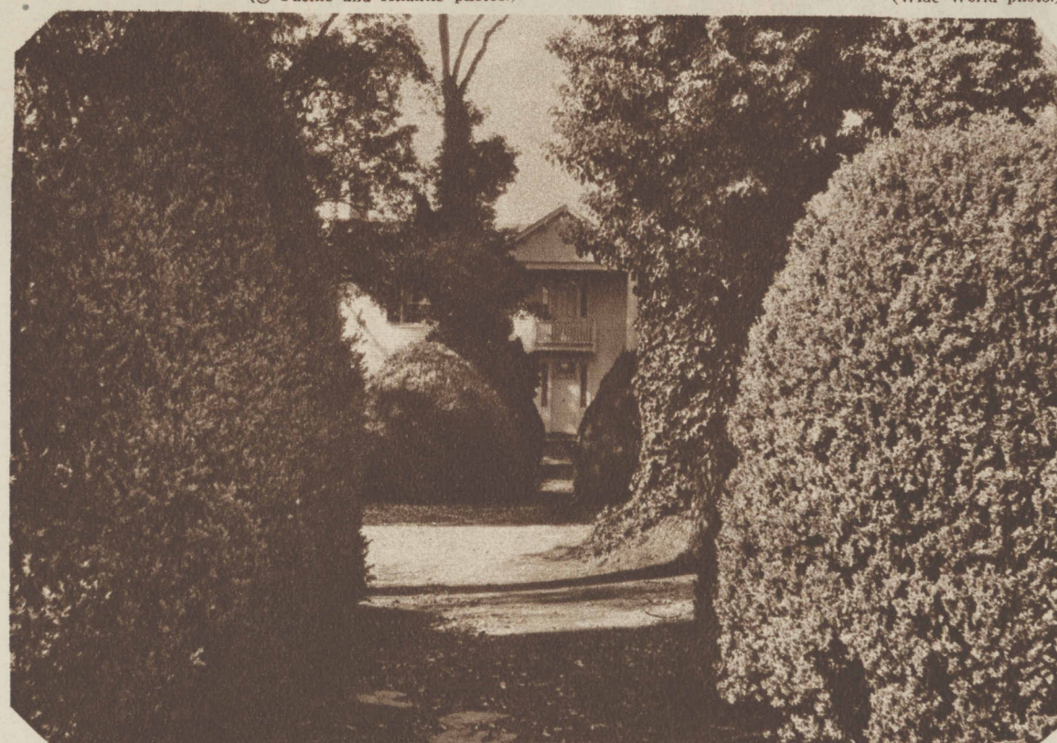
A SHRINE OF PATRIOTISM—Restoration of Ash Lawn, first home of President Monroe, near Charlottesville, Va., is now complete. This lovely vista is from the beginning of the boxwood garden, planted by the originator of the Monroe Doctrine himself.