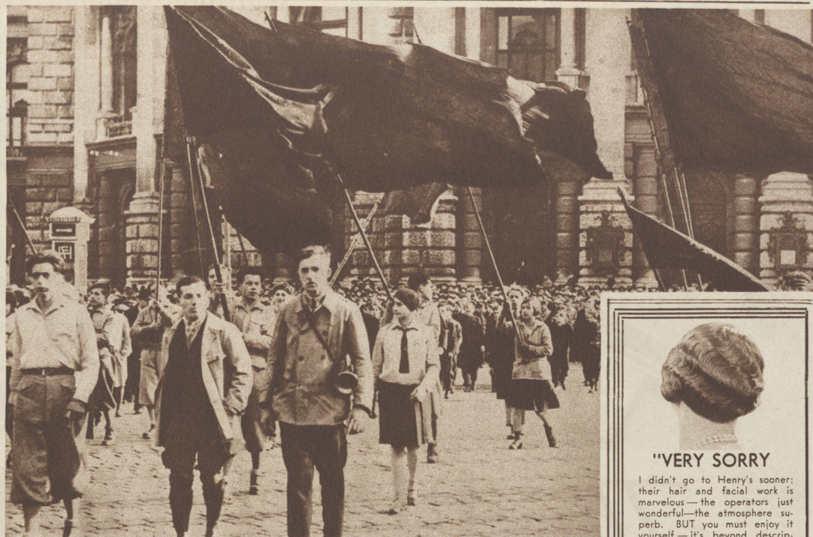
A YOUTH MOVEMENT CELEBRATES THE BIRTHDAY OF THE AUSTRIAN REPUBLIC—Young socialists, both boys and girls, bear fluttering banners in a great Vienna demonstration on the twelfth anniversary of the overthrow of the monarchy.

Gaytees REG. U. S. PAT. OFF. the Tailored Overshoes