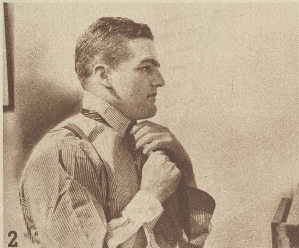
KNOTS HIS TIE AT 7:15 A. M. Majoring in economics, he graduates next June. He writes of his progress in . . .