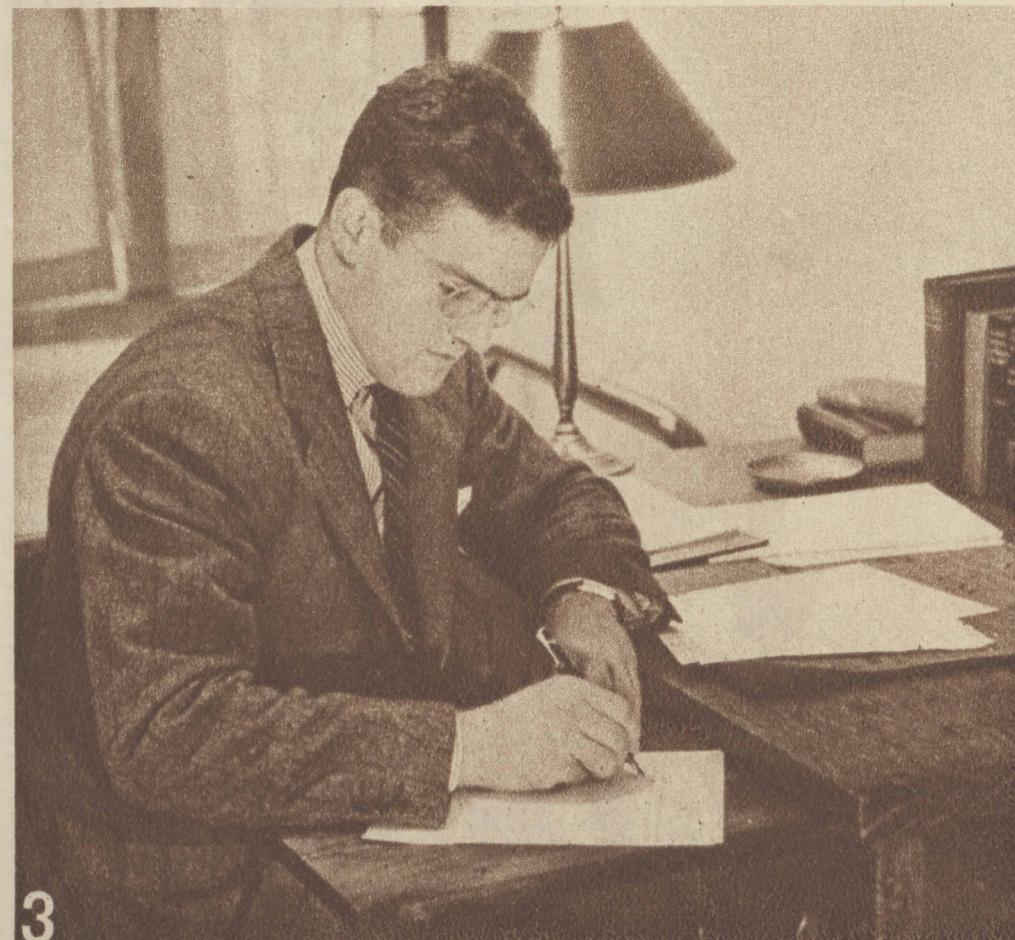
A LETTER to the home folks at Evanston, Ill.