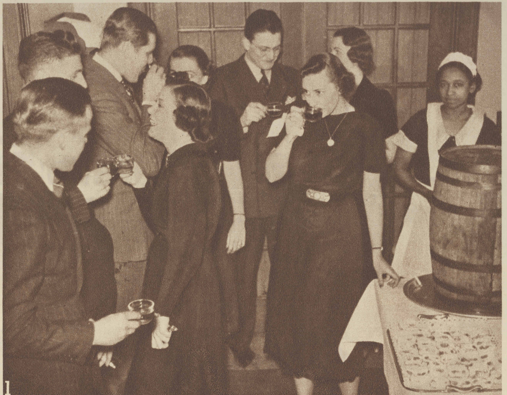
THE POST-FOOTBALL SOCIAL SEASON ON THE CAMPUS GOES INTO HIGH—Alpha Omicron Pi sorority girls of Northwestern university give a house party, serving sweet cider (unspiked) and doughnuts. There was . . .