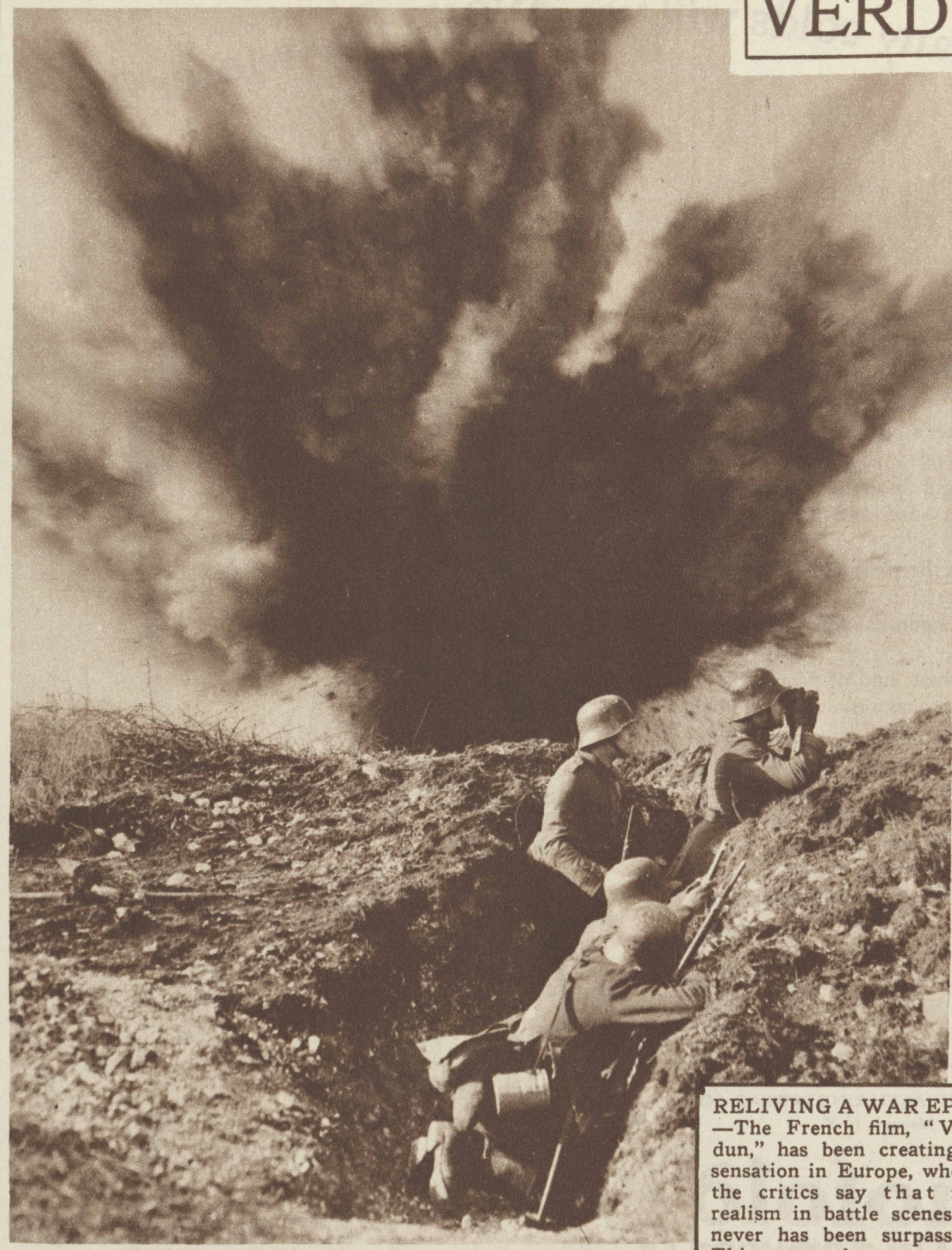
RELIVING A WAREPIC —The French film, "Verdun," has been creating a sensation in Europe, where the critics say that for realism in battle scenes it never has been surpassed. This scene shows a great shell bursting.