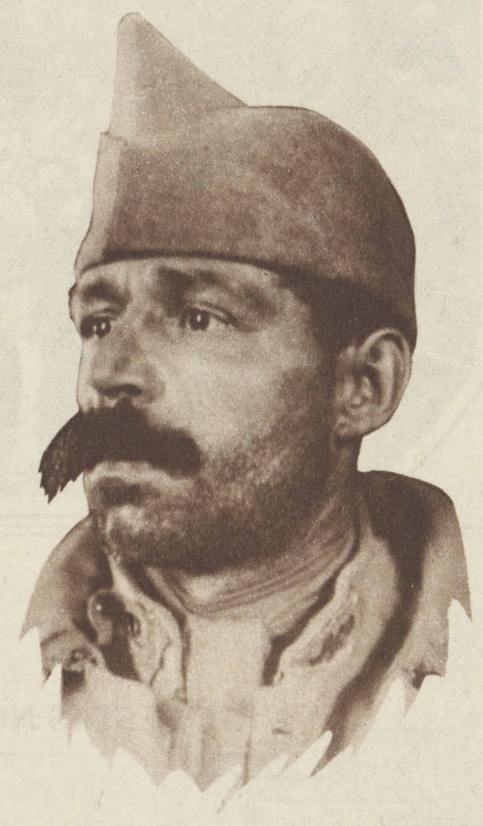
TYPES —Ragged and unkempt were the poilus at Verdun, as depicted in this photoplay. Parisian tramps were selected as representatives of the defenders, and three of them are shown above.