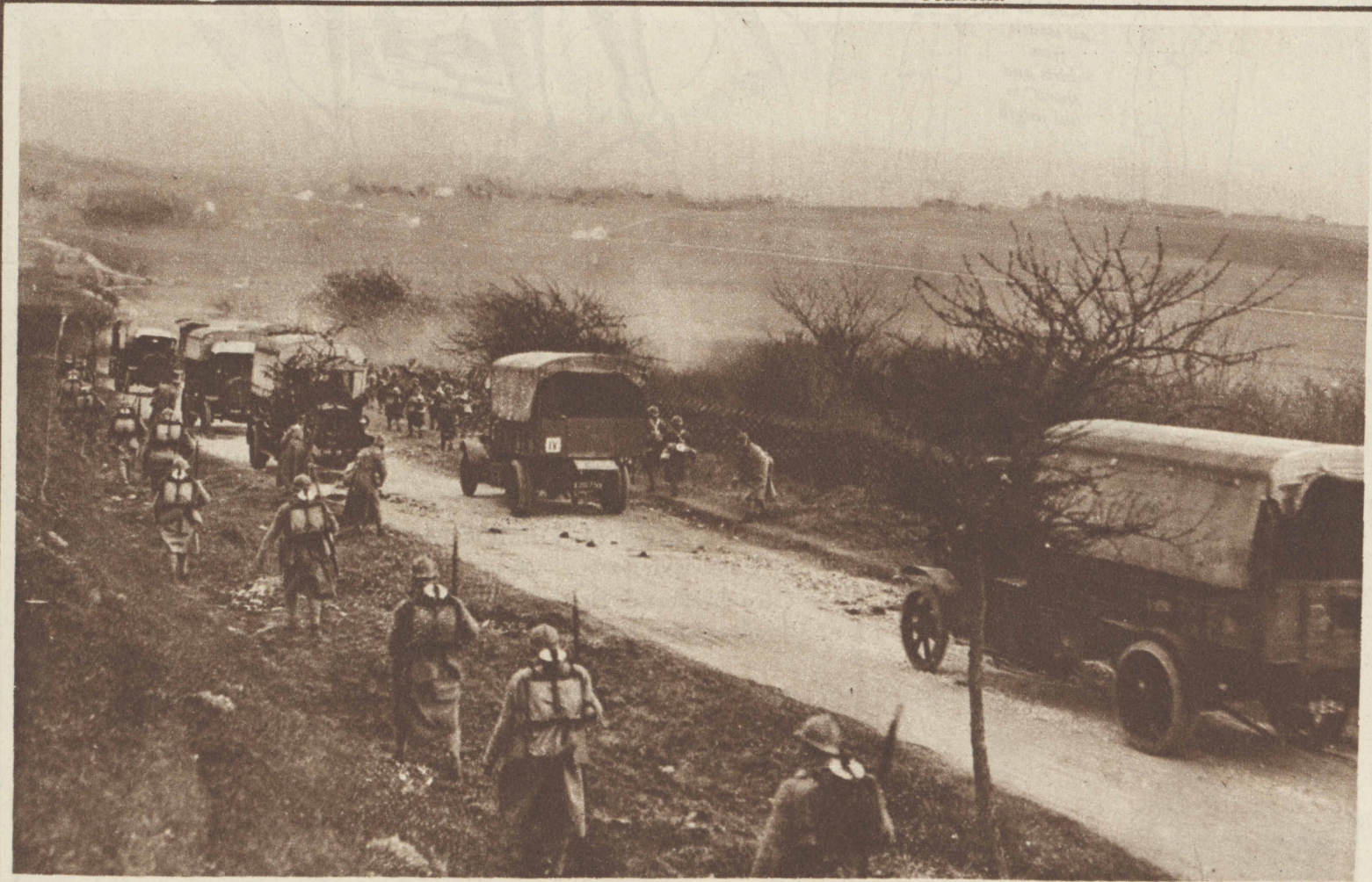
GOING UP THE LINE —All the artillery used in the film, from the French 75's to the German howitzers, is genuine war material as used at the time, and some of the invaders' guns were actually captured on the battlefield. So say the producers, at any rate.