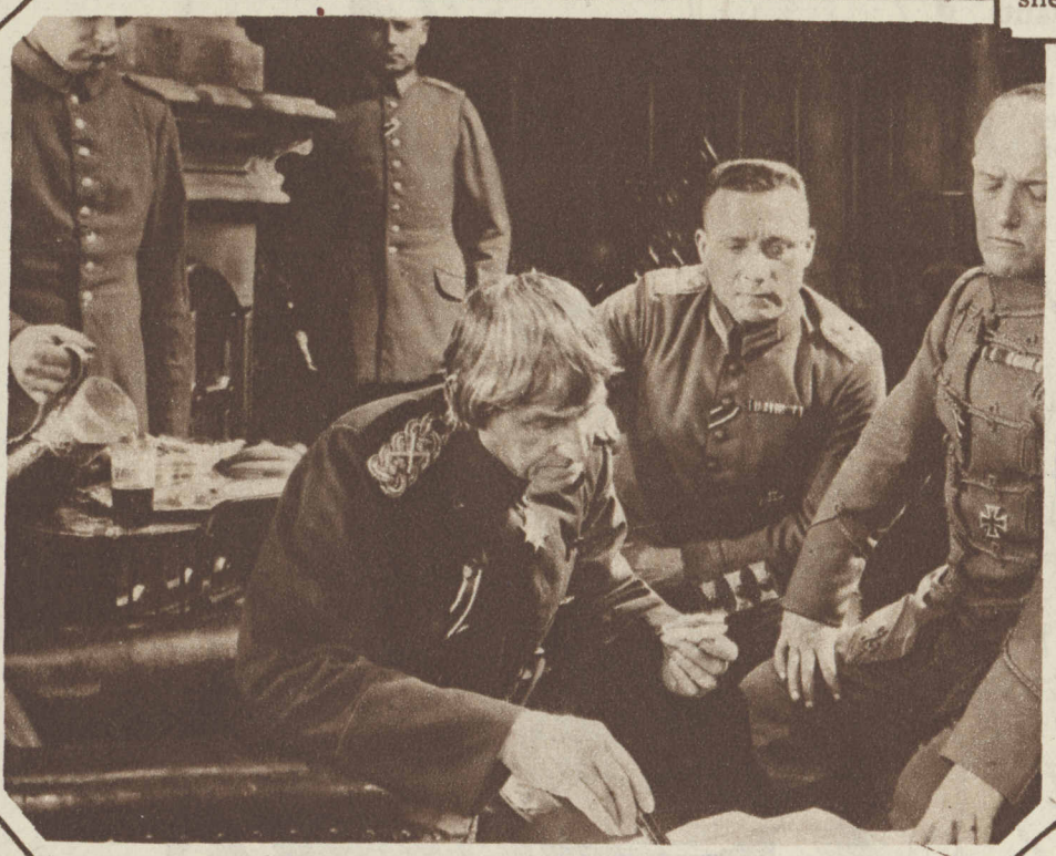
THE STRATEGY THAT FAILED —German officers mapping out a line of attack on the fortified city in the Meuse department of France. Beginning in September, 1914, the enemy from the north laid siege on Verdun for four years, but every assault was turned back in defeat.