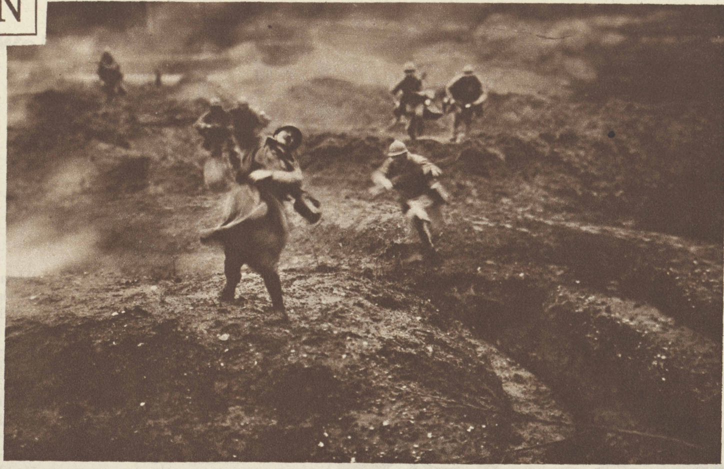
"THEY SHALL NOT PASS!" The cry that steadied the lines in one of the greatest examples of heroic endurance ever known is echoed in this spectacle. Here is a graphic representation of a French attack at Verdun.