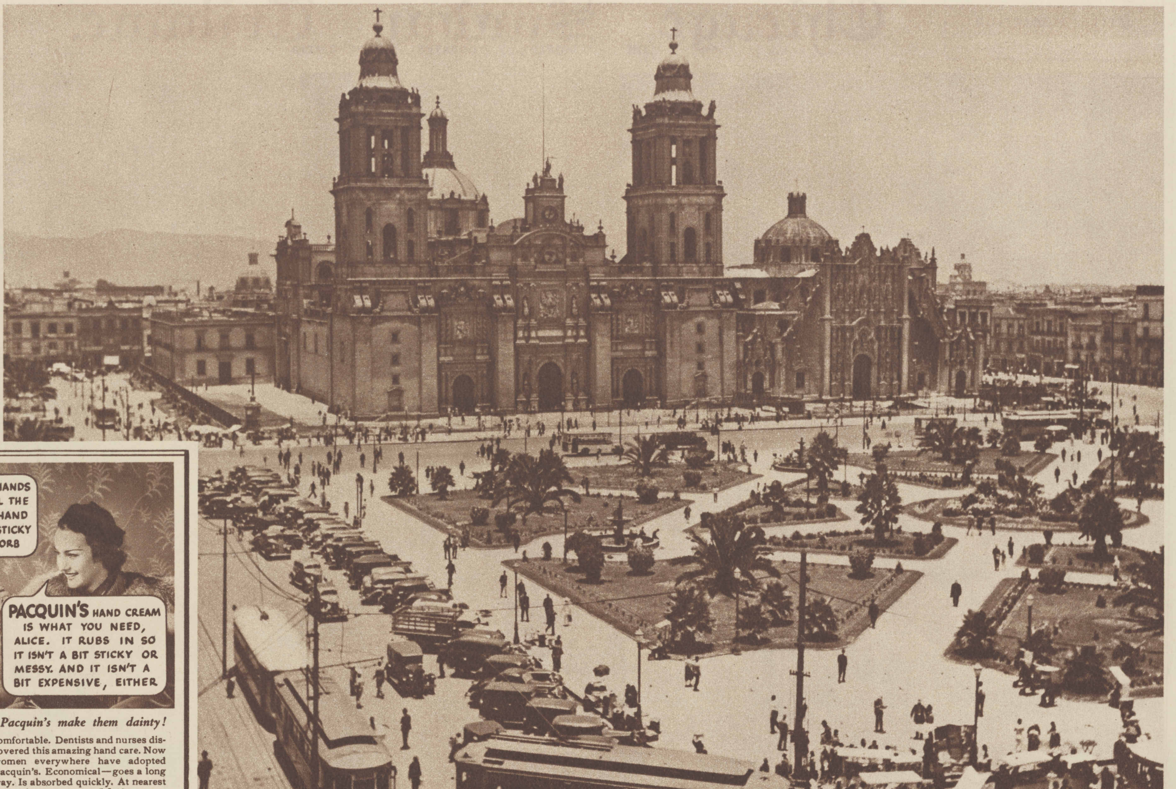
SCENIC GRANDEUR IN MEXICO CITY—A view of the cathedral, with three other churches visible in the background.

Those poor puckered hands—let Pacquin's make them dainty! After doing the dishes, after hanging out the wash, every night before retiring—rub in Pacquin's Hand Cream, if you want pretty hands. Not a sticky lotion, but a dainty hand cream. Soothes hands, keeps them comfortable. Dentists and nurses discovered this amazing hand care. Now women everywhere have adopted Pacquin's. Economical—goes a long way. Is absorbed quickly. At nearest drug, department, or 5 & 10c stores.