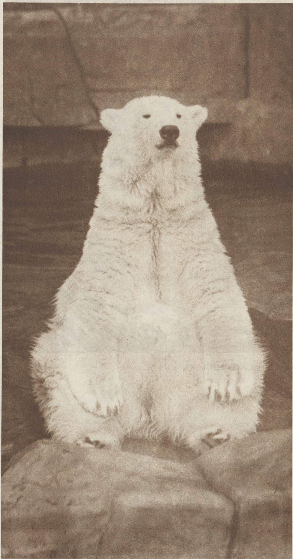
POLAR BEAR AT THE ZOO AT BROOKFIELD.