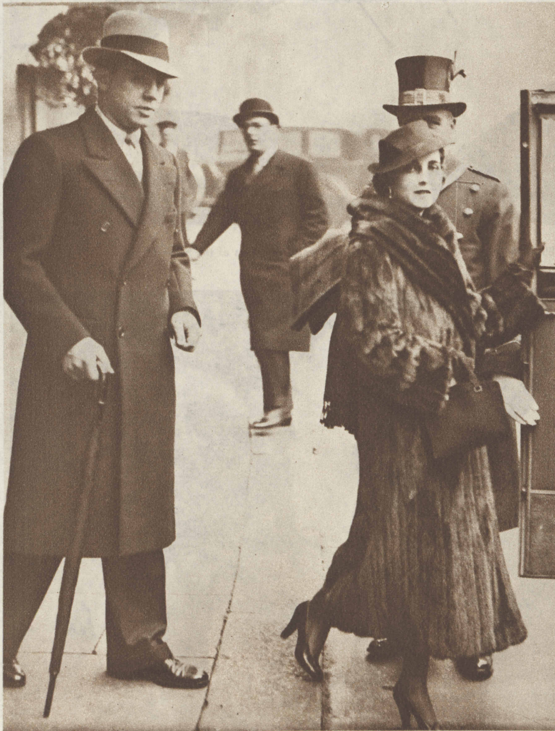
WOOLWORTH HEIRESS AND HER PRINCE—Prince Alexis Mdivani and Barbara, nee Hutton, at London.