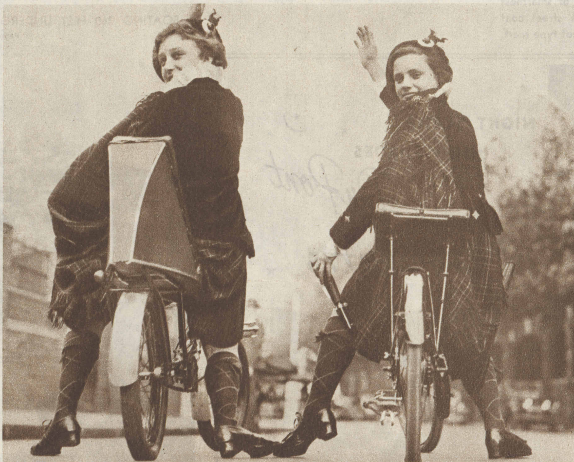
AT A LONDON BICYCLE SHOW.