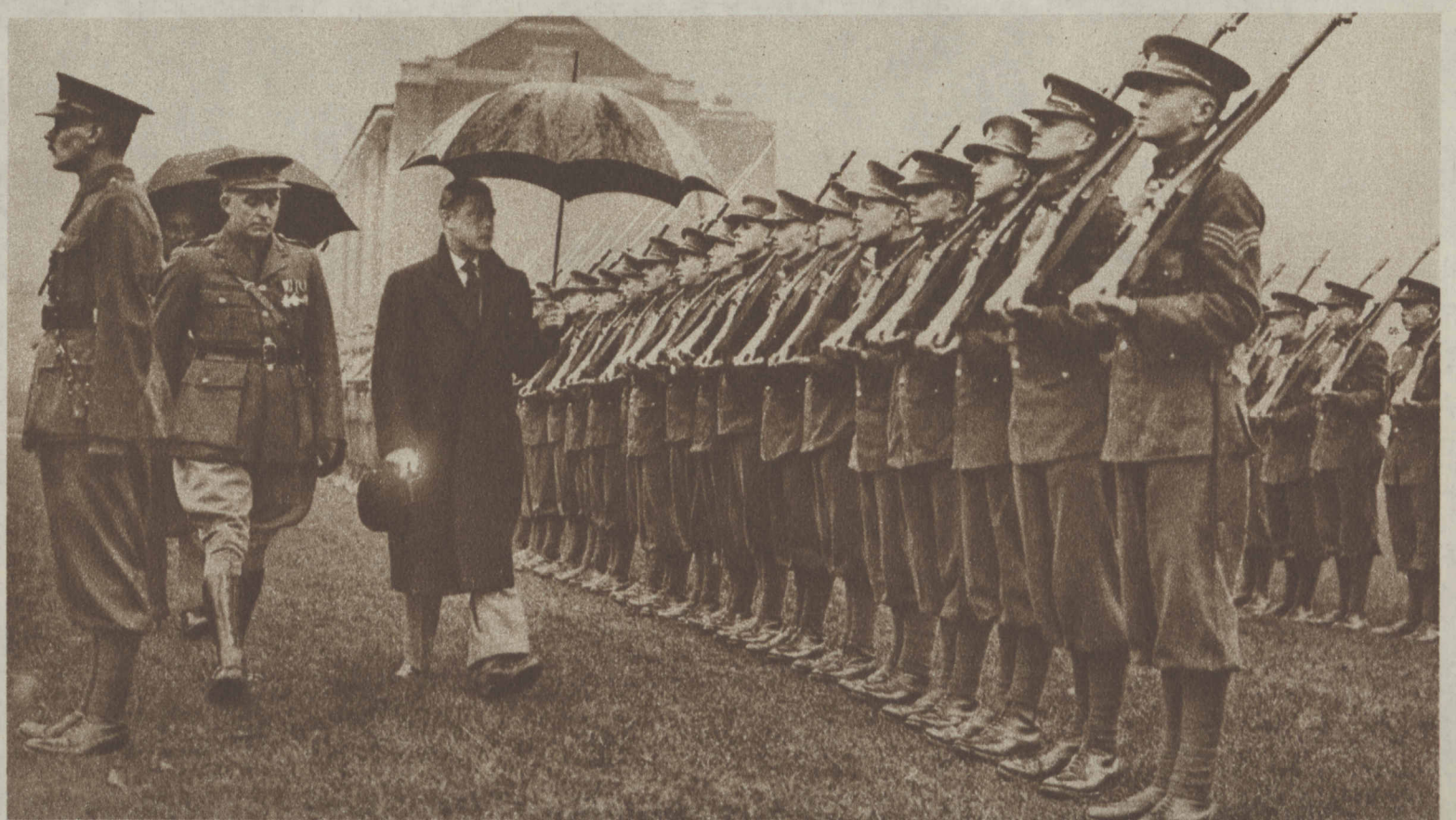
BENEATH AN UMBRELLA, the prince of Wales inspects student officers.

For free sample of Ointment and Soap with literature write Resinol, Dept. MN10, Baltimore, Md.