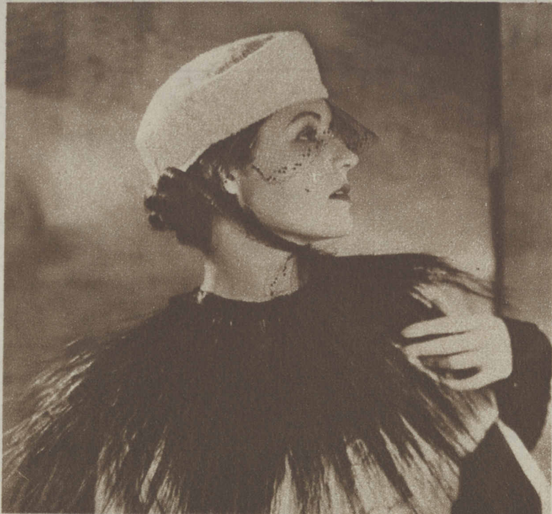
A WHITE TURBAN with a black veil tying under the chin tops a dramatic black and white satin frock, with collar of monkey fur.