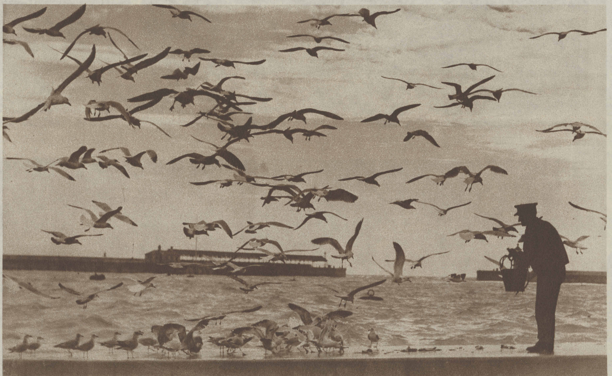
GULLS AT RAMSGATE HARBOR, ENGLAND.