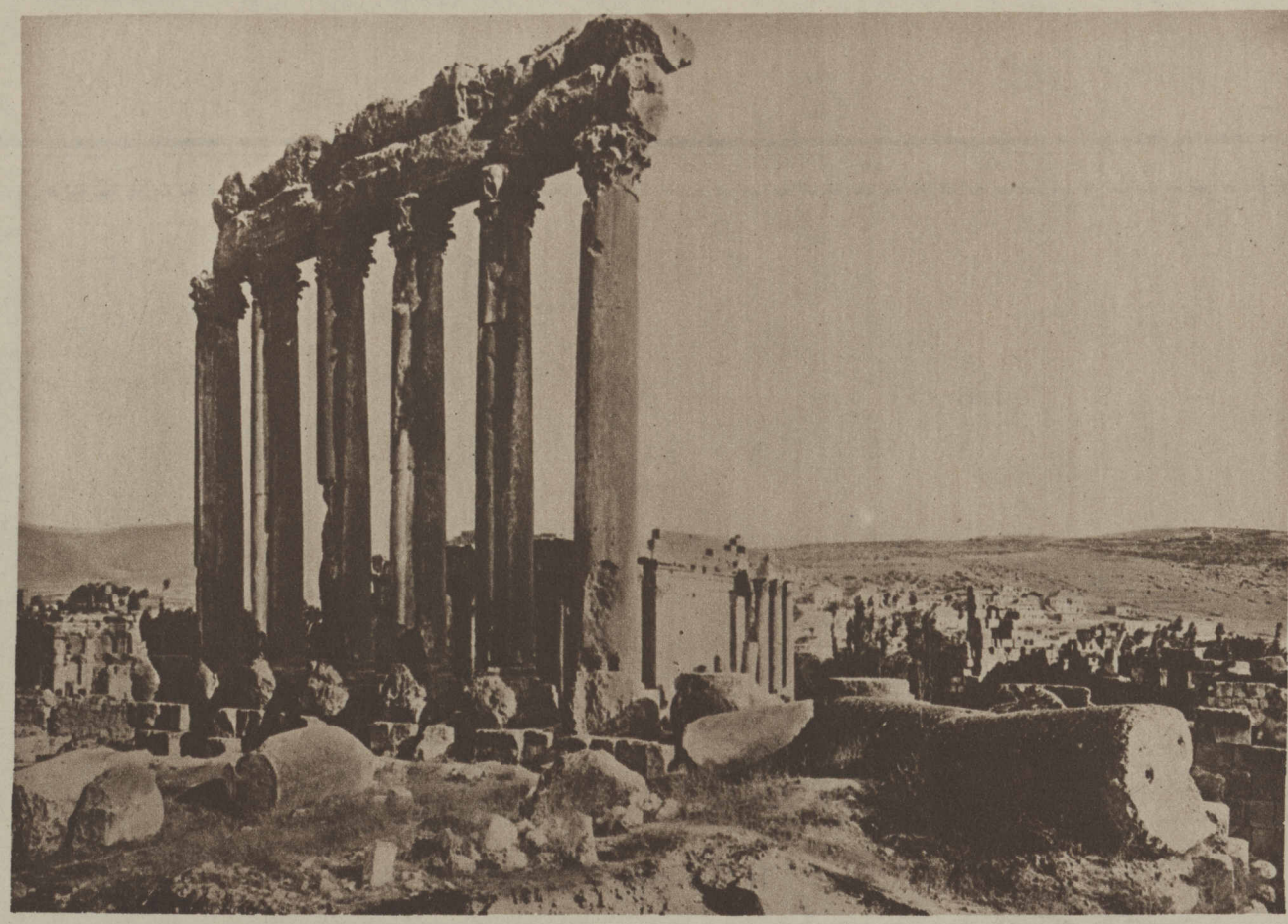
SIX GHOSTLY SENTINELS are all that remain of the 200 stately columns that once encircled the Temple of Jupiter in Baalbek, ancient "city of the sun." Now plans are under way to restore the Syrian city to its former magnificence. The modern municipality may be seen in the background.