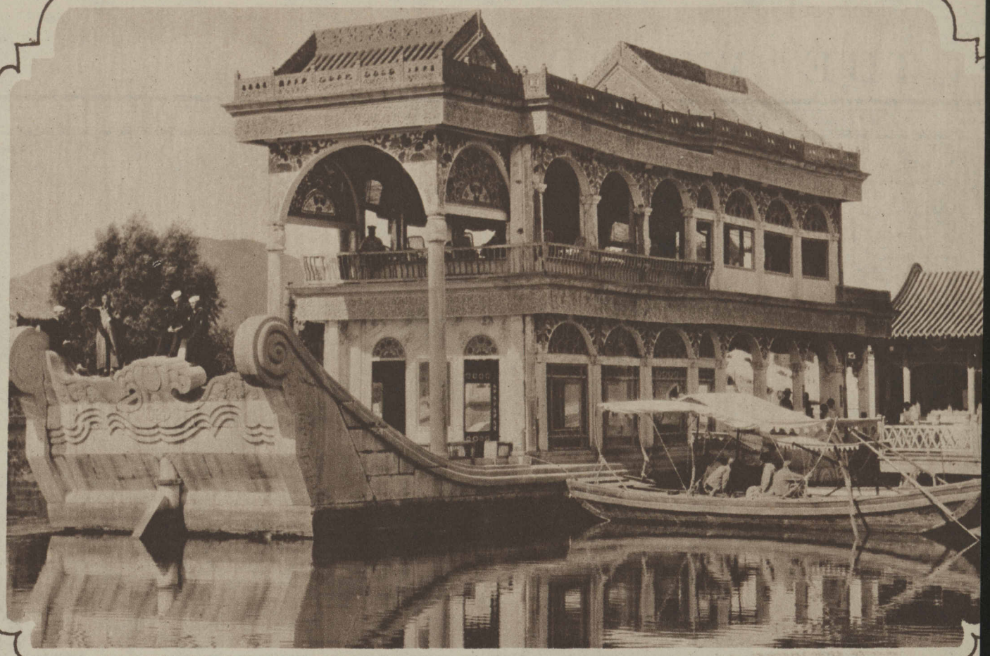
FROM FLOATING PALACE TO TEA ROOM—Originally built for the private use of the dowager empress of China, this magnificent marble boat now serves as a refreshment emporium. Anchored off Peiping, China, it attracts orientals and occidentals alike.

They're new,,, they're different,,, they're PRIMROSE HOUSE astonishing values at $1.00,, $1.50,, $2.00