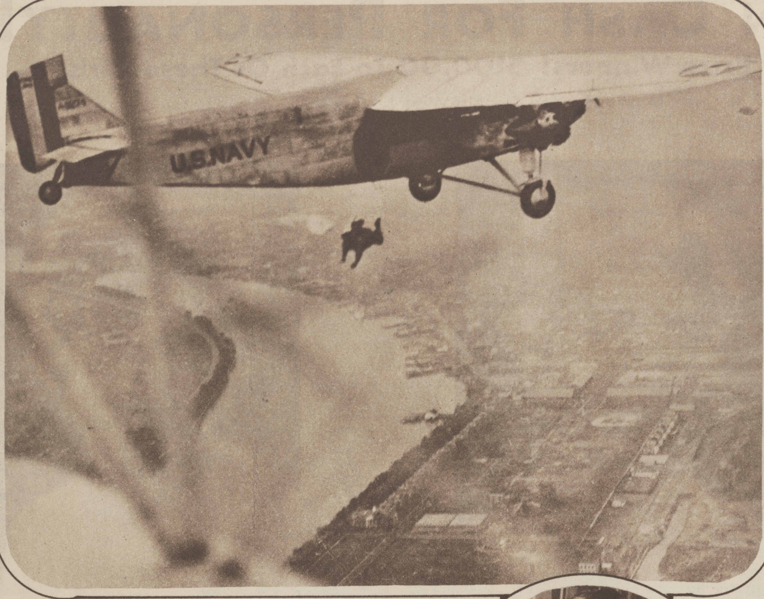
JUST TO GIVE THE CROWD A THRILL, a naval officer leaped head first, instead of feet downward, from a plane in an exhibition over Washington. However, he had his parachute with him.