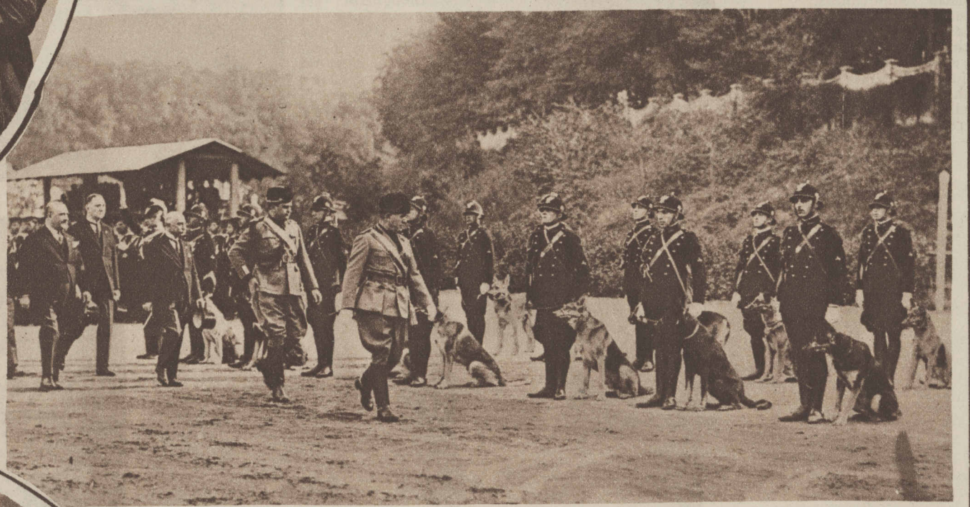
ALSATIAN POLICE DOGS and the Italian mounted police vied for the attention of Premier Mussolini when he reviewed them in Rome. Men and dogs are famed for their smartness, and the men likewise for the smartness of their attire and equipment.