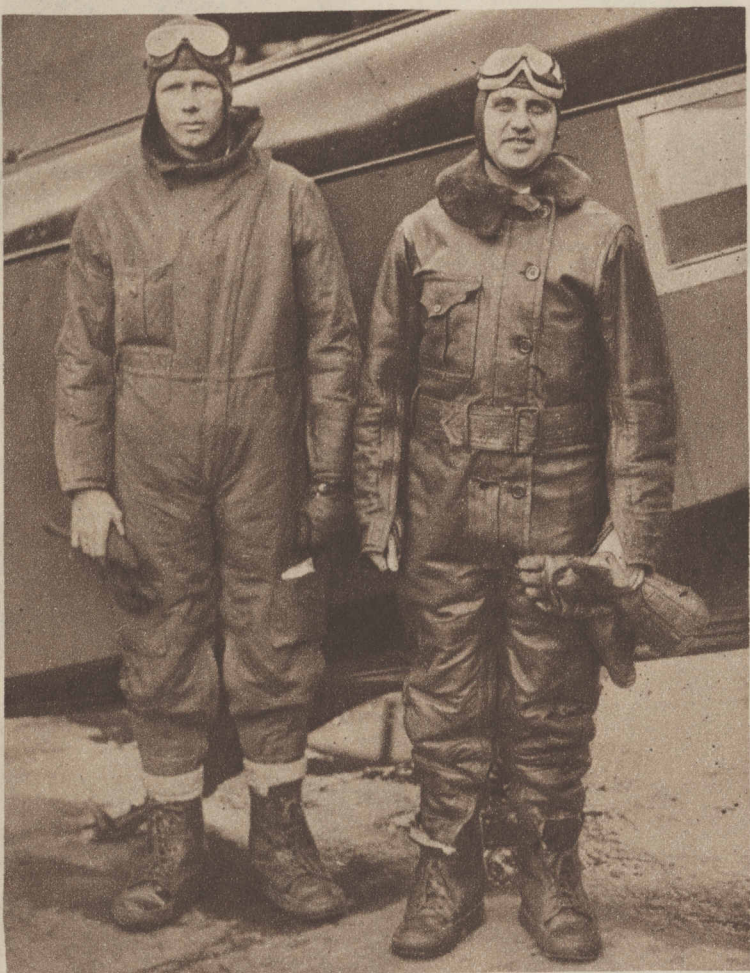
TWO FLYING AMBASSADORS—Lindy, envoy of good will, teams up for flight near New York with Harry F. Guggenheim, the new ambassador to Cuba, who succeeds Noble Brandon Judah of Chicago. The two have been closely associated for several years, Mr. Guggenheim being president of the Guggenheim fund for promotion of aeronautics, and Col. Lindbergh a trustee.