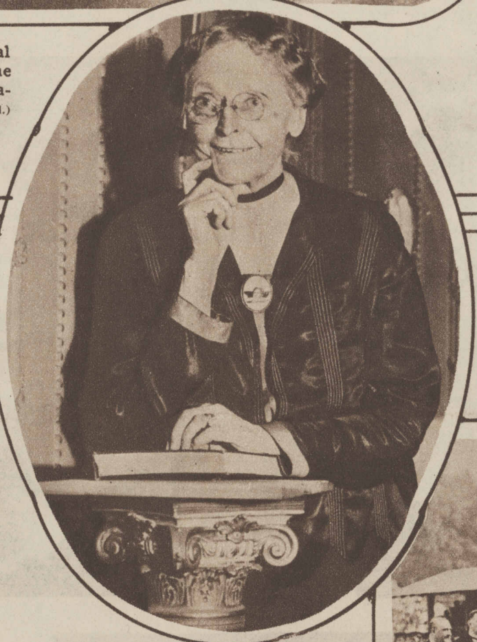
AT 72 SHE'LL FLY OVER THOSE MOUNTAINS which she climbed thirty years ago, will Miss Annie Peck of New York. A distinguished peak scaler with nine trips to South America to her credit, a trail-blazer honored by governments of the southern continent, Miss Peck will make her tenth visit to the mountains an aerial good will expedition.