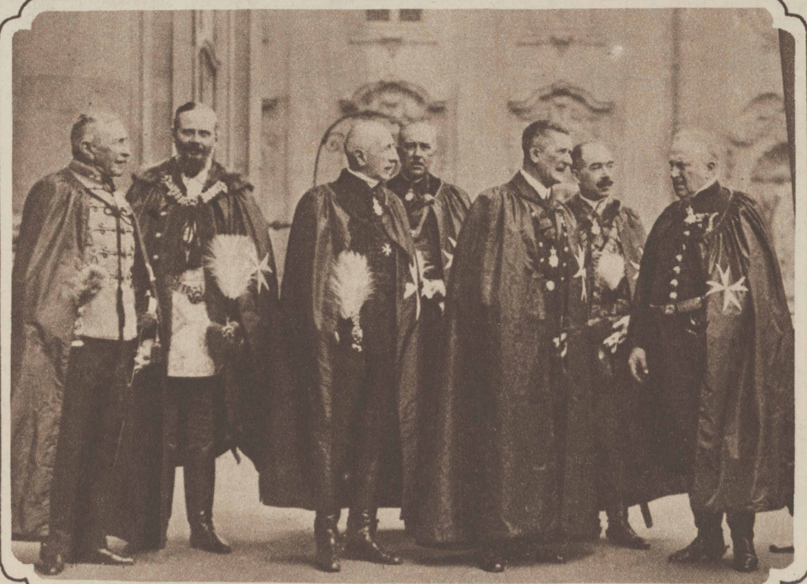
CEREMONY AND SYMBOLISM appeared on the terrace of the royal palace at Budapest when Admiral Nicholas von Horthy, regent of Hungary, was inducted as an honorary knight into the Protestant layman Order of St. John. The regent is third from the right.