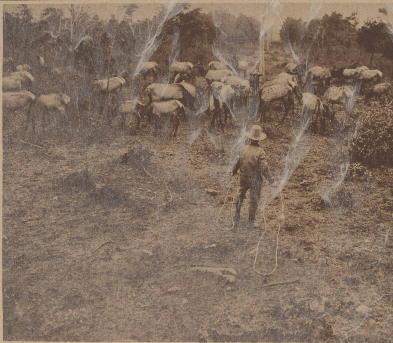
THE WILD WEST IS IN THE EAST on the elk farm at Middleboro, Mass., where you behold a Yankee cowboy busy at the annual roundup. As winter approaches, the babies of the herd are cut out and herded on a separate range. They are put on a special diet, consisting chiefly of milk.