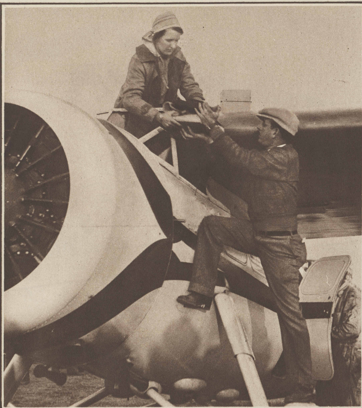
AT THE START OF HER DISTANCE RECORD FLIGHT—Miss Ruth Nichols is pictured in the cockpit of her plane receiving a package of food just before she took off from the Oakland, Cal., airport for her cross-country flight. Landing at Bowman field, Louisville, Ky., she established a new long distance record for women, beating by almost 200 miles the previous 1,810 mile mark set by Maryse Bastie of France in a flight from Paris to Russia.