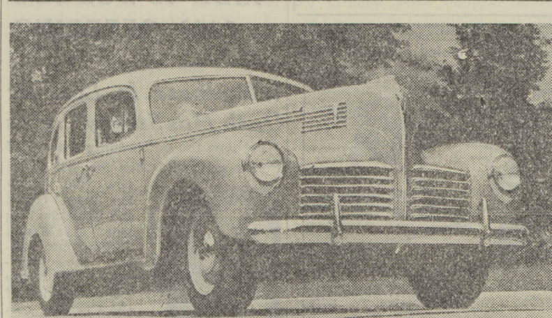
Here is the 1940 Hudson eight sedan which recently won a number of speed records held under the rules of the American Automobile association

and the trade alike is the natural WANT TO SAVE outcome of the workings of this principle within our organization. Be cause markets unerringly respond to greater value, we are actively planning for a very considerable increase n our business for 1940.