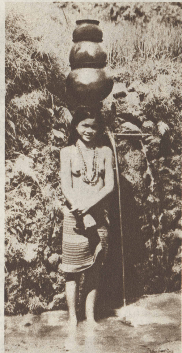
FILIPINO MAIDEN of the Kalinga tribe. Water jugs of the type atop her head are still in frequent use in the islands.