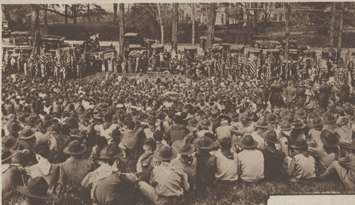
HONORING THE MEMORY OF T. R. , Boy Scouts took part in the annual pilgrimage to Oyster Bay on the day before the seventy-first anniversary of Roosevelt's birth. Because it fell on Sunday, Navy day, normally celebrated on the former President's natal day, was given official cognizance last Monday.