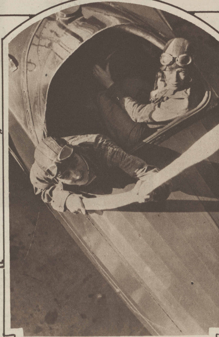
OUT FOR A REFUELING RECORD —Bobbie Trout, 22, and Elinor Smith, 19, past and present holders, respectively, of the women's solo endurance flight record, combine forces in an effort to smash the man-made record. Miss Trout, as she demonstrates, will handle the fuel line, and Miss Smith will operate the controls.