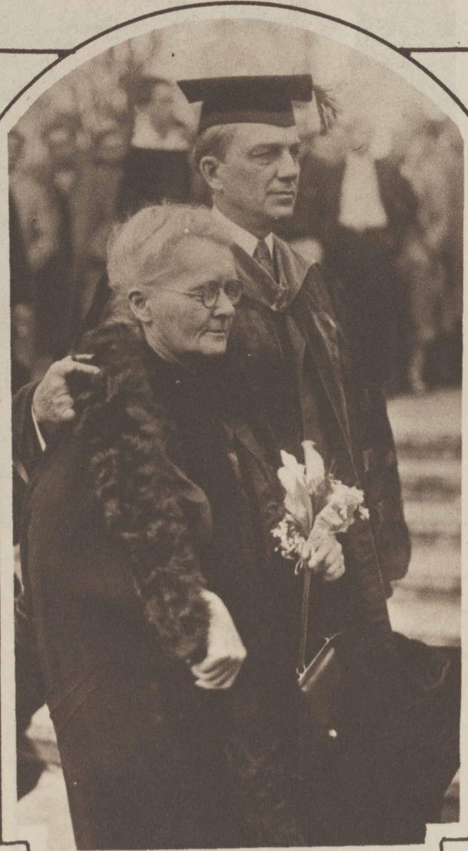
AMERICA HONORS MME. CURIE —The co-discoverer of radium, newly arrived in the states from France, visited St. Lawrence university, at Canton, N. Y., and dedicated a chemistry hall in her first public address. With her is Owen D. Young.