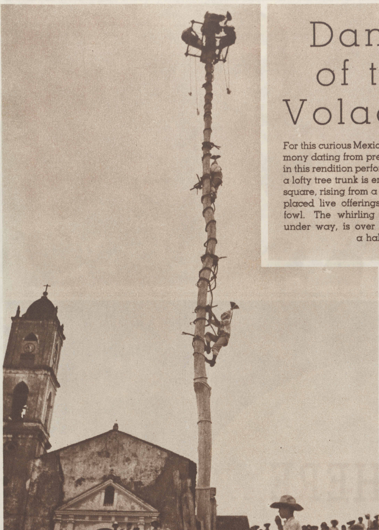
1. Five dancers mount the towering staf, atop which is a movable spindle.

For this curious Mexican religious ceremony dating from pre-Aztec times, and in this rendition performed in Papantla, a lofty tree trunk is erected in the town square, rising from a hole in which are placed live offerings of animals and fowl. The whirling spectacle, once under way, is over in a minute and a half.