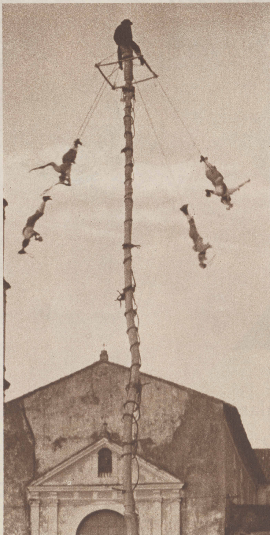
4. The dancers hurtle farther and farther into space, the weight of their bodies unwinding the rope from the spindle.