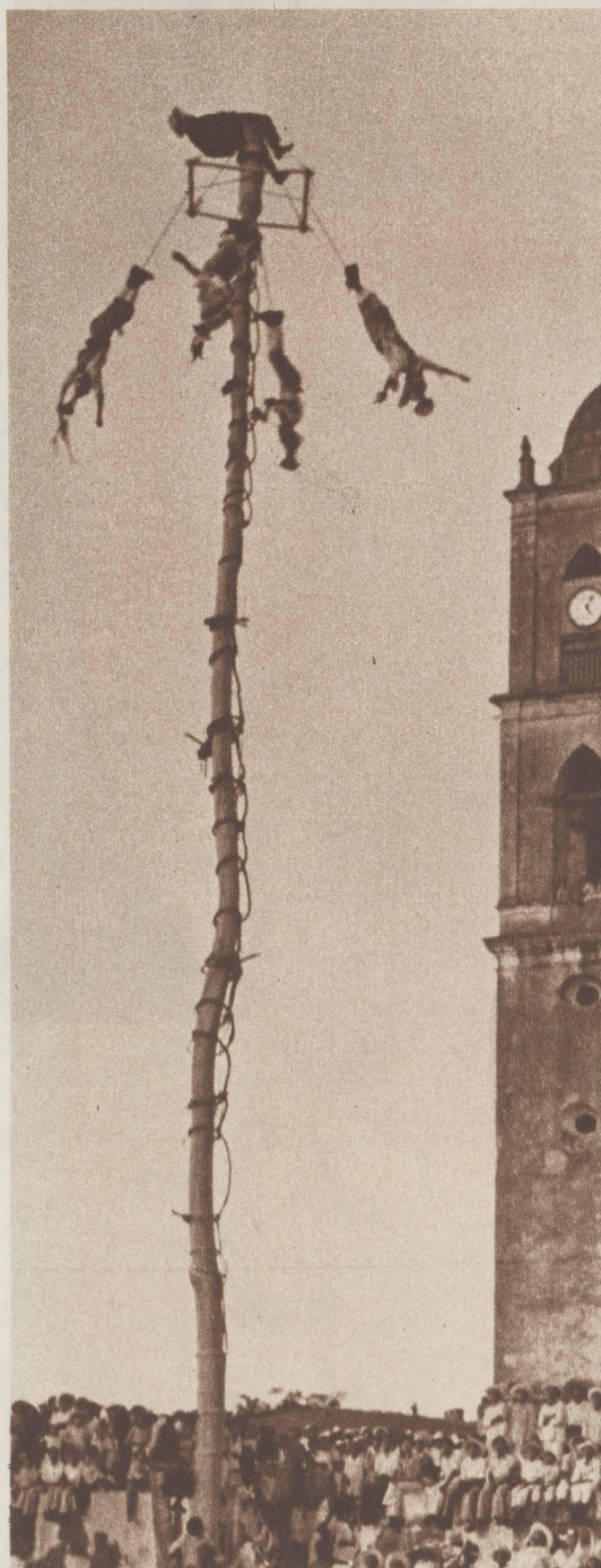
3. With ropes attached to their feet, the dancers swing off into space.