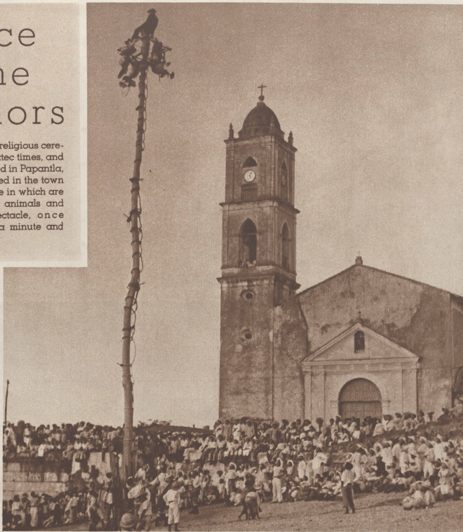
2. One of the dancers sits upon the movable spindle, around which four ropes are wound.