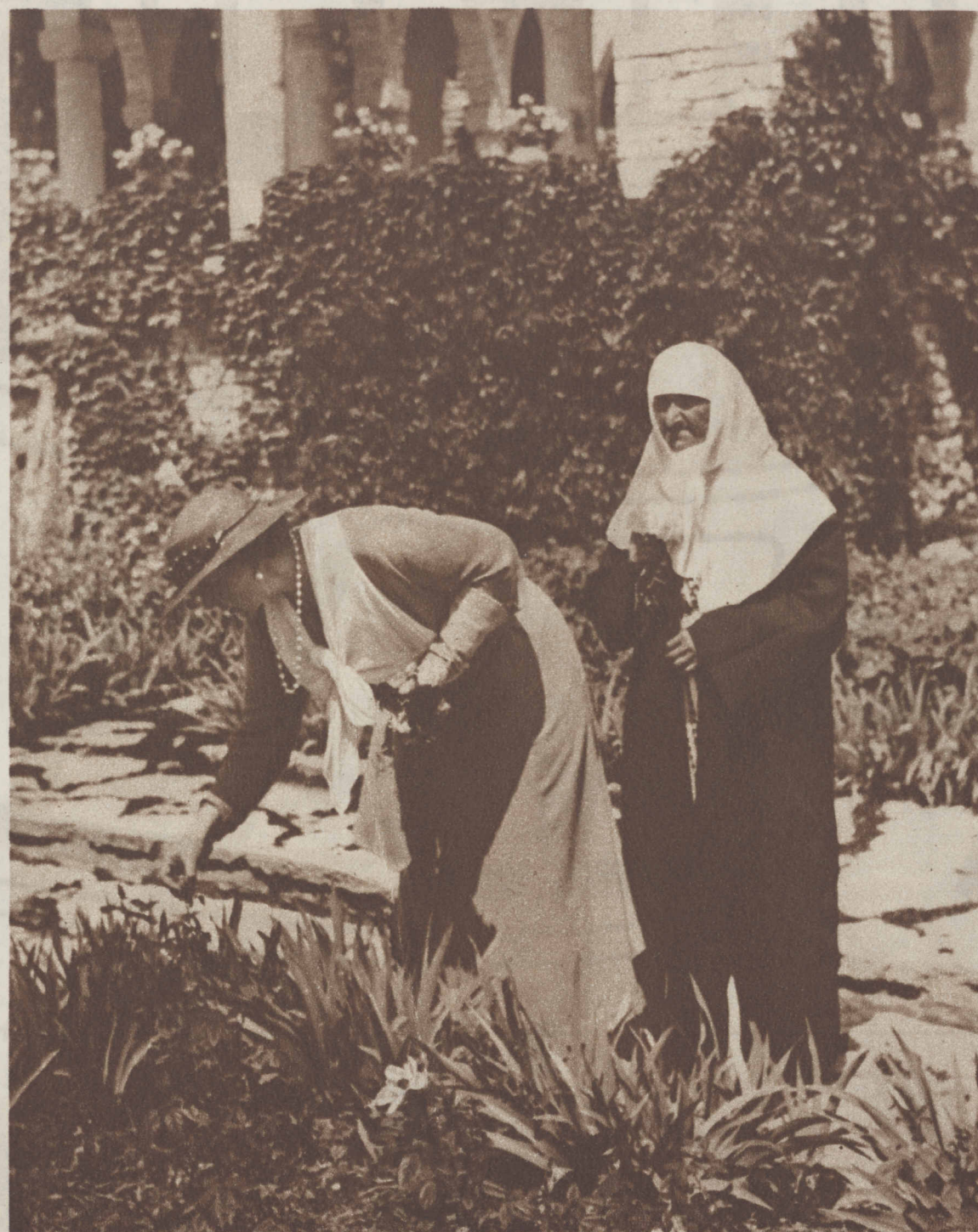
IN THE CASTLE GARDEN—Dowager Queen Marie with an attendant.