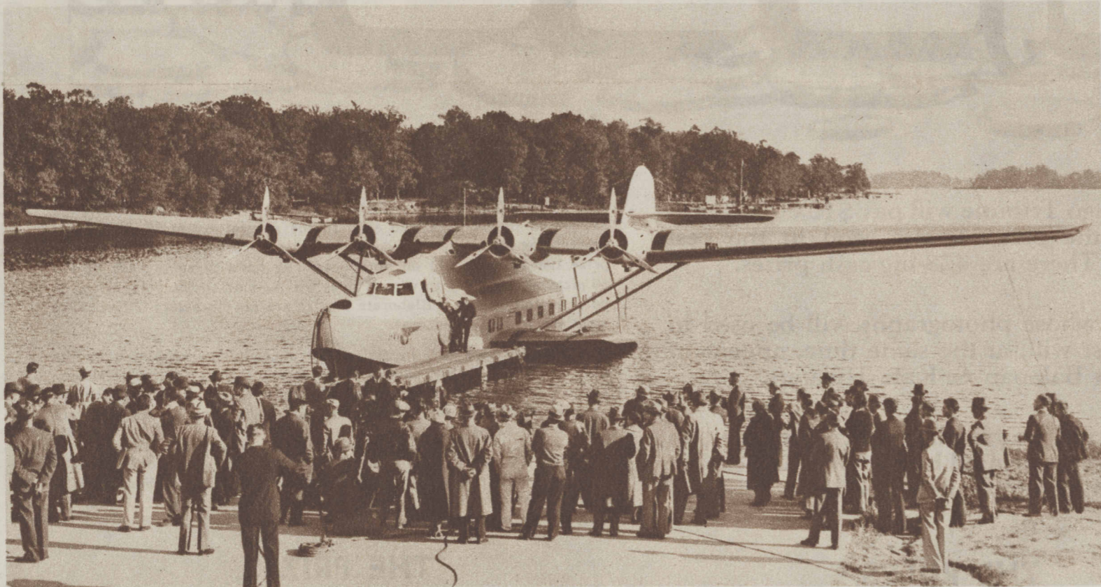
FOR TRANS-PACIFIC SERVICE—The "China Clipper" in Chesapeake bay. The plane has four motors with a total of 3200 horsepower, and has a wing spread of 130 feet; it has a nonstop radius of 3,000 miles, and carries forty-three passengers and a crew of seven.