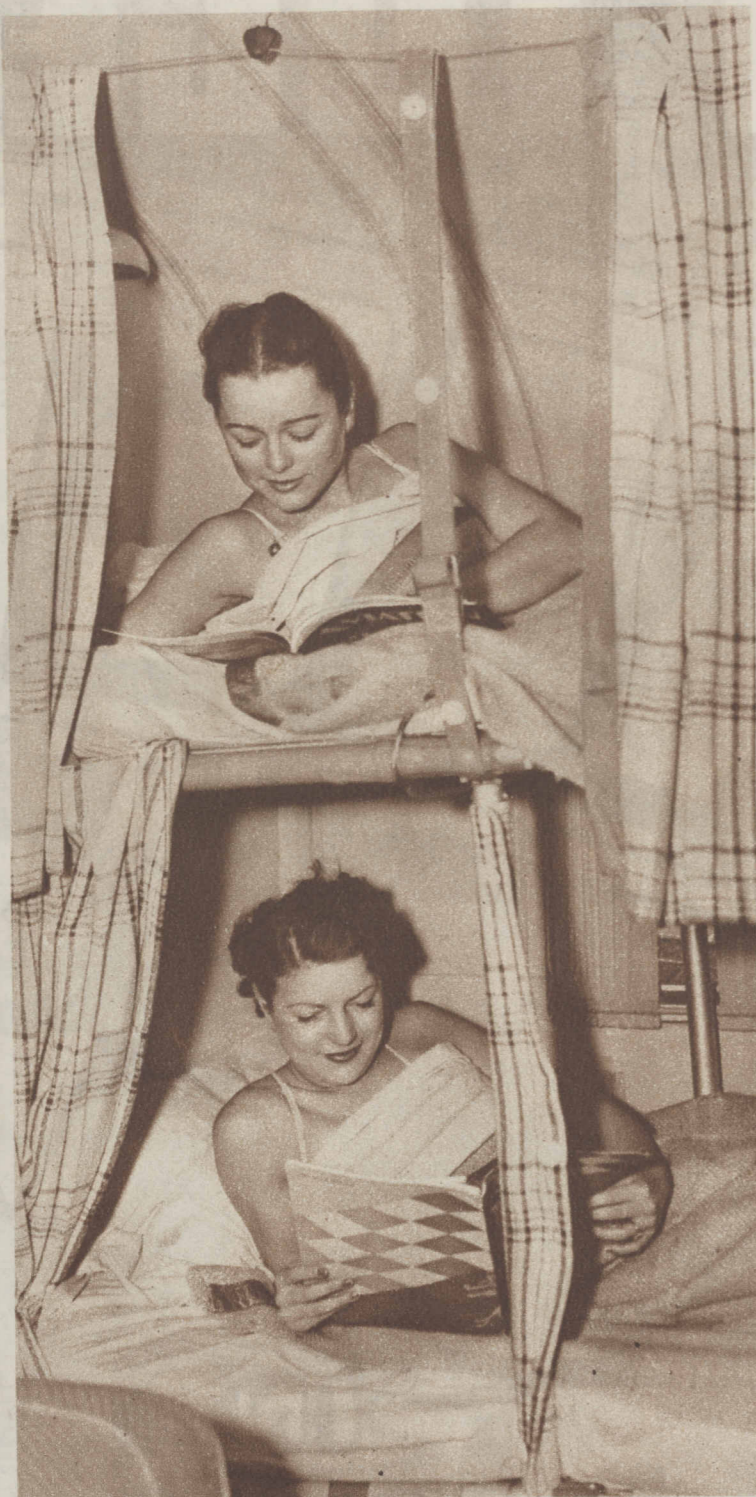
AERIAL LOWER AND UPPER—Two young women demonstrate sleeping accommodations of the "China Clipper," biggest flying boat ever built in the United States.