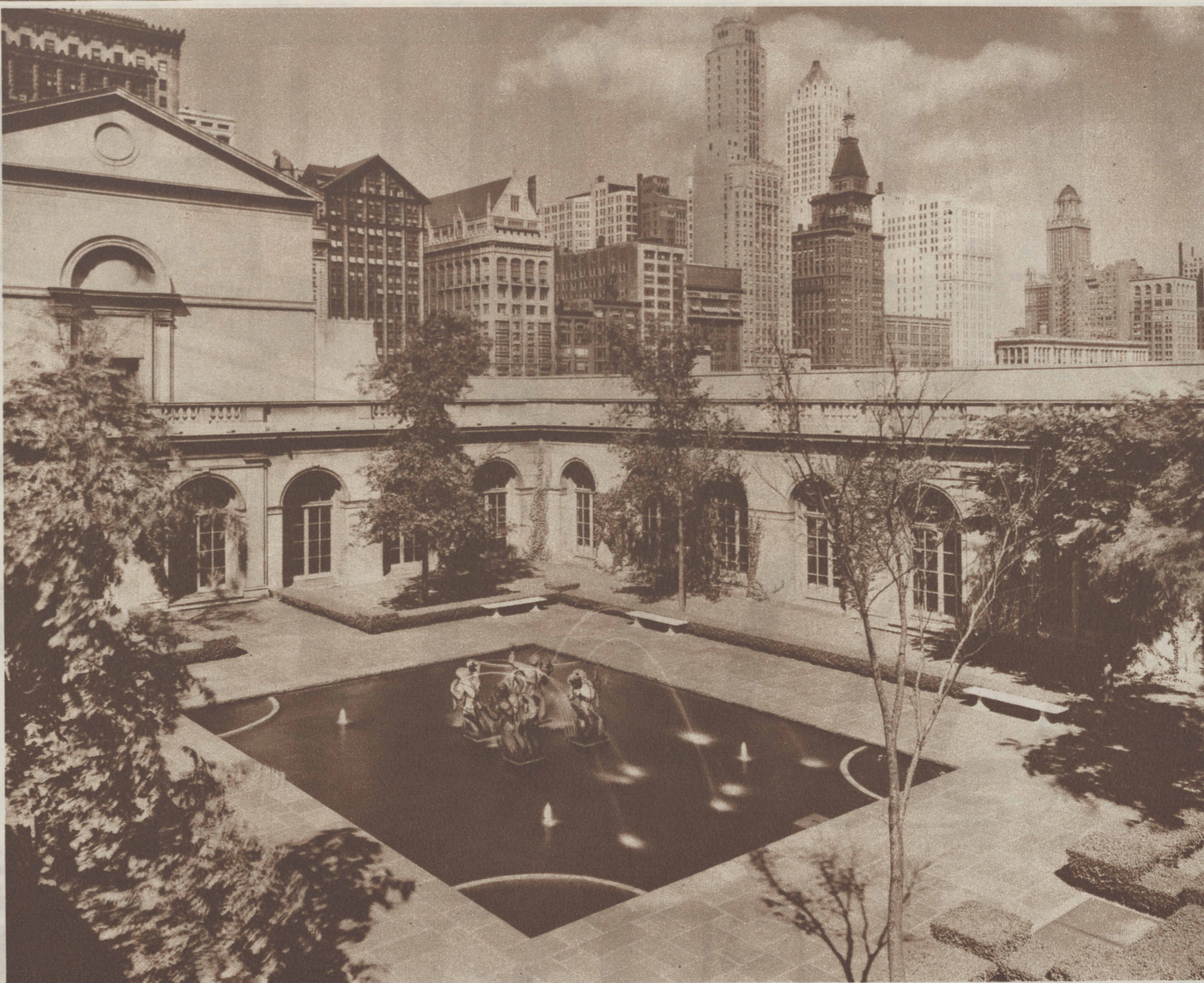
DO YOU KNOW THIS SCENE? A whisper from the boulevard's skyscrapers is McKinlock court, at the rear of the Art Institute, in the center of which plays Carl Milles' Fountain of the Tritons.