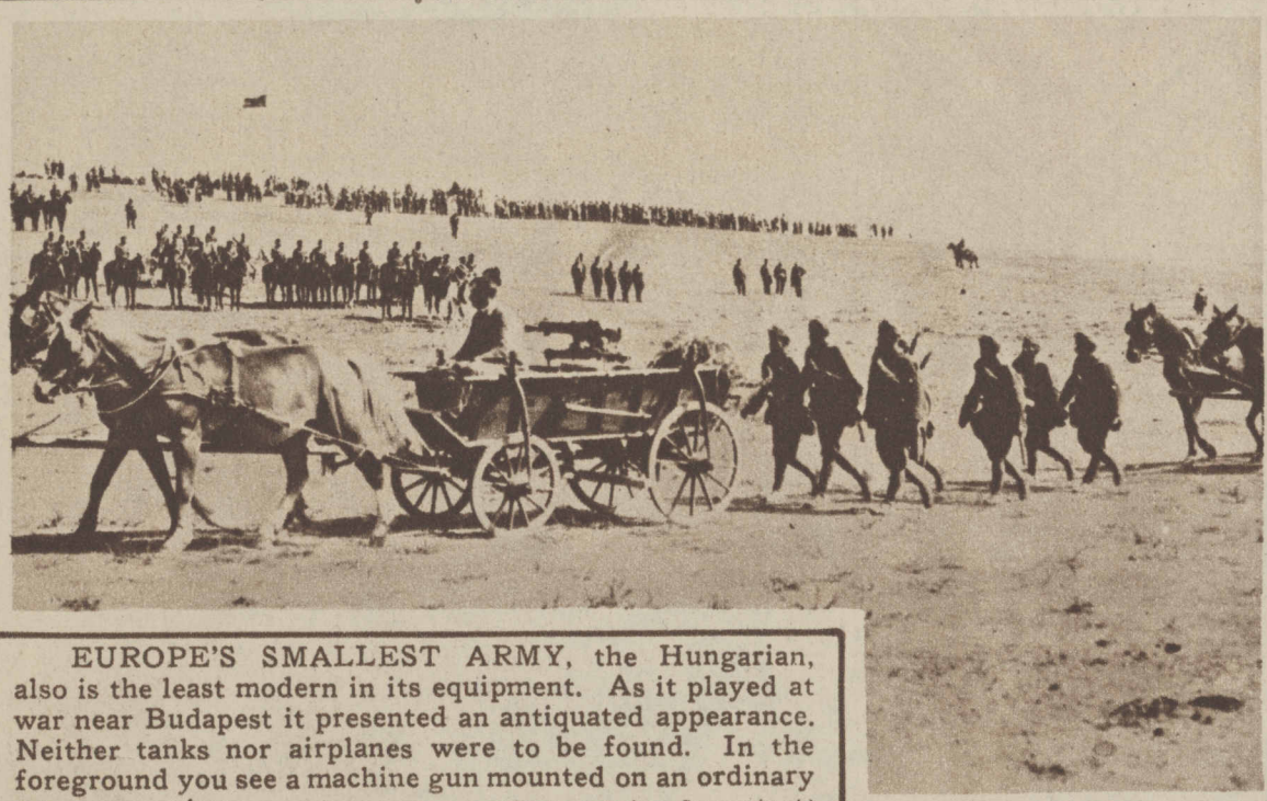
EUROPE'S SMALLEST ARMY, the Hungarian, also is the least modern in its equipment. As it played at war near Budapest it presented an antiquated appearance. Neither tanks nor airplanes were to be found. In the foreground you see a machine gun mounted on an ordinary peasant carriage.