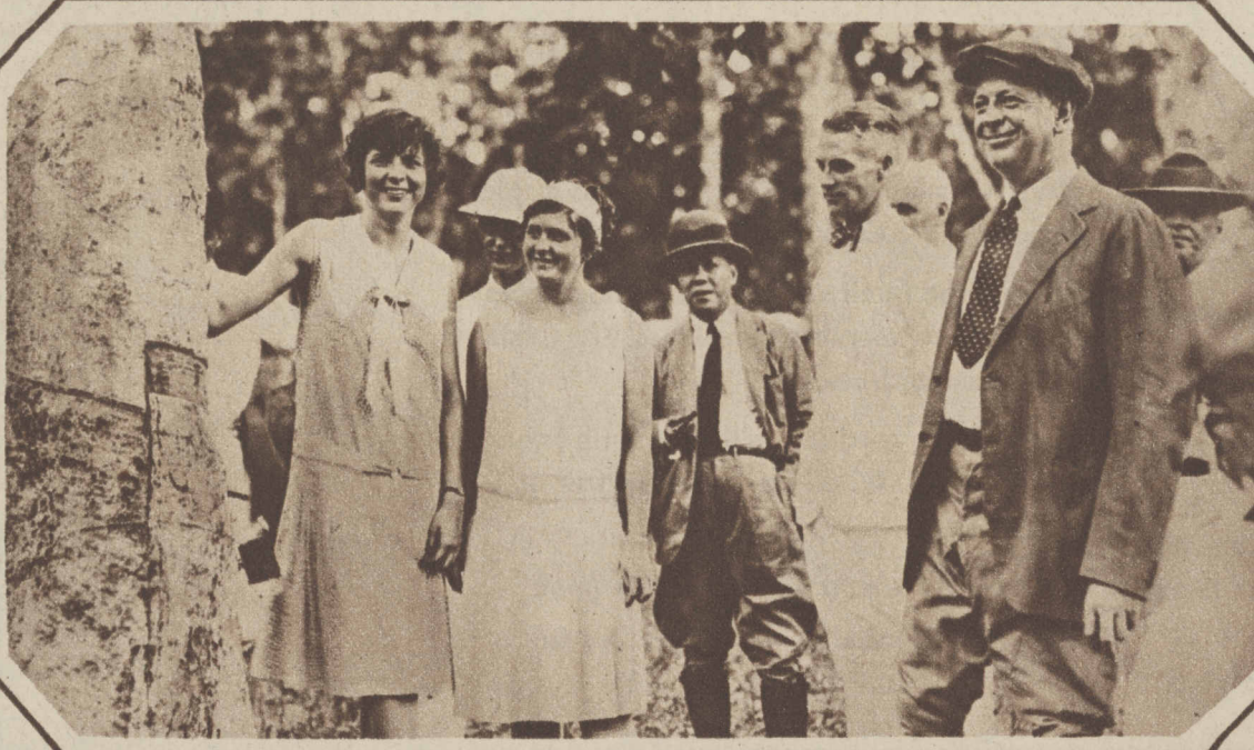
THE OLDEST RUBBER TREE on Basilan island, in the Philippines, received an official visit from Dwight F. Davis, governor-general of the islands, and party. The governor is at the right; two of his daughters are at the left.